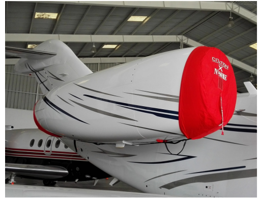
Citation X Intake/Exhaust Cover Set