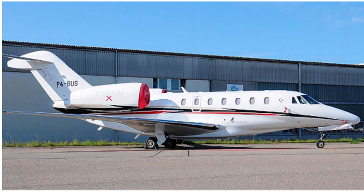
Citation X Intake & Pitot Tube Covers