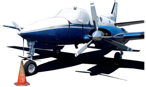
King Air Cockpit Cover, belly-strap type