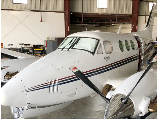
Beech King Air 90 & 100 (U-21, RU-21, T-44) Cockpit Heatshields

for cockpit overheating, but an external fabric cover is more effective for long-term protection.