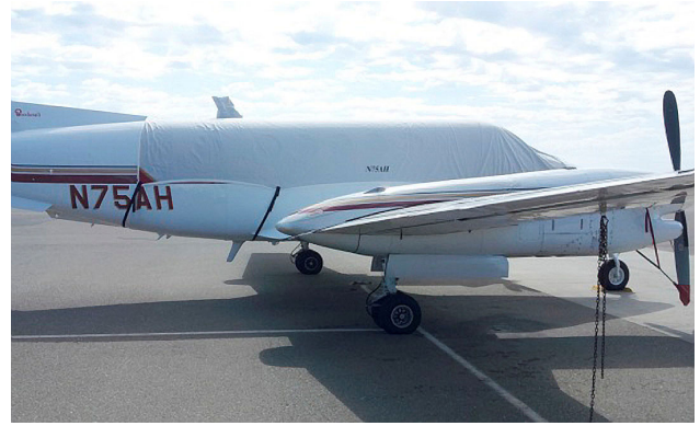
King Air 350 Canopy Cover