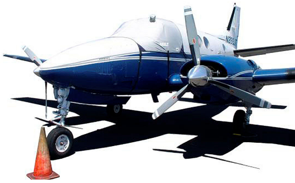
King Air Cockpit Cover, belly-strap type