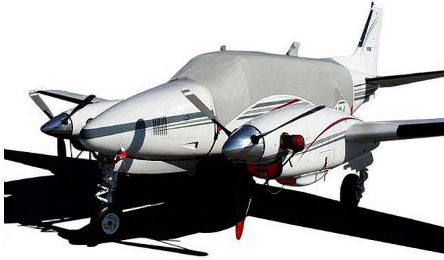
King Air Canopy Cover, Engine Plugs, Prop-Tie/Exhaust Covers

The material is very reflective, and tests show that the cabin interior temperature can be reduced to near-ambient temperature on the hottest of days. It is water, ice and snow repellent, yet breathable to allow moisture to escape from between the cover and the aircraft surface.