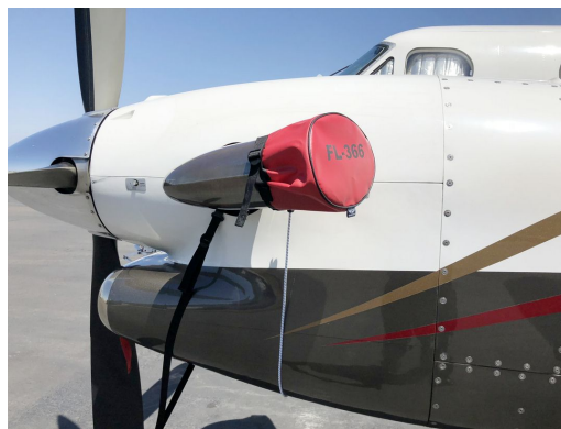
Beech King Air 350 Prop Tie-Downs/Exhaust Covers Combination