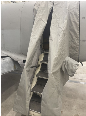
King Air Airstair Coor Cover

WINTER USE MATERIAL - Made with Solution-Dyed Polyester fabric, this option is intended for seasonal use to aid in deicing, rain mitigation, or for occasional travel. The material is lighter and more compact, but more susceptible to UV damage and may have a shorter useful life if used continuously outside than the all-year use material.