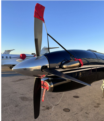
Beech King Air C90A Plug & Prop Tie Set

Engine Inlet Plugs are custom fit for your Beech King Air C90B, C90GT intakes, made with heavy-duty vinyl material, and stuffed with a single block of sculpted urethane foam. Each plug has a zipper that allows the foam to be removed and dried if necessary. Engine plugs have warning flags that are visible from the cockpit or 'remove before flight' streamers sewn onto the face of the plugs. Most plugs are imprinted with the aircraft registration number in black for an extra charge. Storage bag NOT included. Engine plugs may be inserted after flight when the engine is still warm. Engine Inlet Plugs are commonly referred to as Cowl Plugs, Intake Plugs, Cowl Blocks, Engine Blocks, and Engine Bungs.