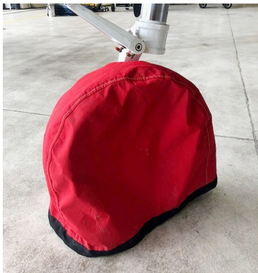
Beech King Air 300 Tire Covers (nose gear)

ALL-YEAR USE MATERIAL - Made with Silver Acrylic Sunbrella canvas, the all-year use material is the best option for sun protection and cover longevity. This heavier more durable material is intended for all weather conditions, such as rain and snow or lots of sun.