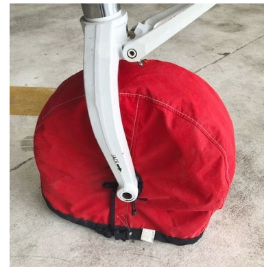
Beech King Air 300 Tire Covers (nose gear)