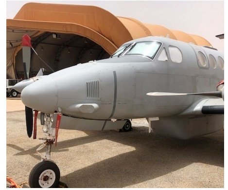
Beech King Air Cockpit HeatShields