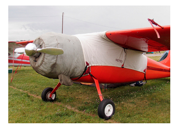
Cessna 195 Over-Top Canopy Cover & Engine Cover