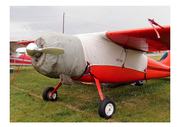
Cessna 195 Canopy Cover, over-top, 24" fwd ext to cover cowl ring gap, gas cap ext.