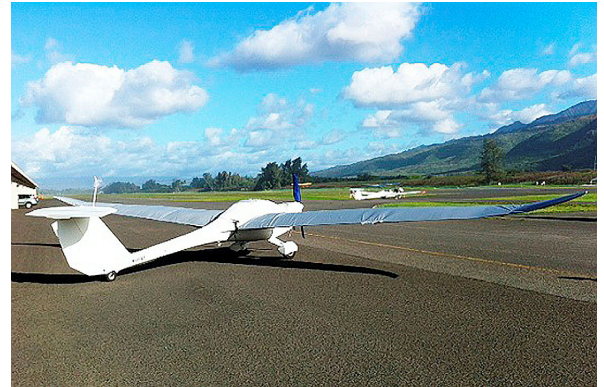
Lambda Canopy/Engine Cover and Wing Covers