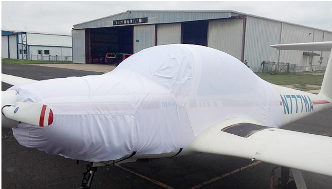
Taifun 17E Canopy/Engine Cover, test fit cover