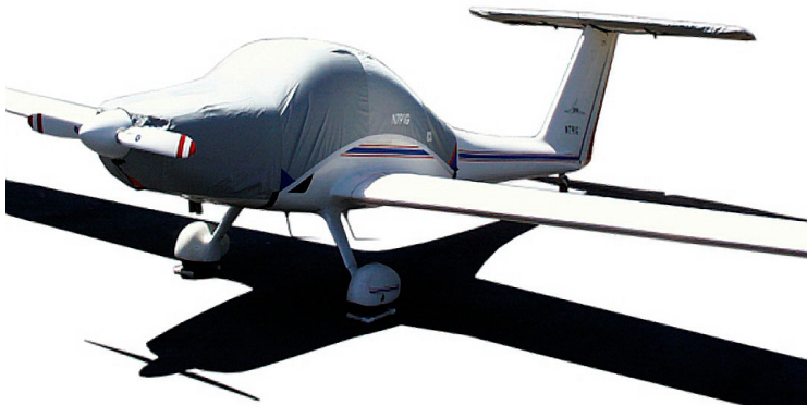
Grob 109 Canopy/Engine Cover & Horiz. Stabilizer Cover