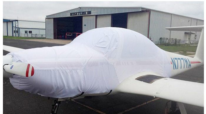
Taifun 17E Canopy/Engine Cover, test fit cover