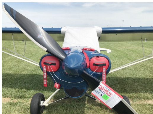
Cub Crafters EX2 Canopy Cover, Engine Plugs

Engine Inlet Plugs are custom fit for your CubCrafters CC-11, Sport Cub S2, & Carbon Cub intakes, made with heavy-duty vinyl material, and stuffed with a single block of sculpted urethane foam. Each plug has a zipper that allows the foam to be removed and dried if necessary. Engine plugs have warning flags that are visible from the cockpit or 'remove before flight' streamers sewn onto the face of the plugs. Most plugs are imprinted with the aircraft registration number in black for an extra charge. Storage bag NOT included. Engine plugs may be inserted after flight when the engine is still warm. Engine Inlet Plugs are commonly referred to as Cowl Plugs, Intake Plugs, Cowl Blocks, Engine Blocks, and Engine Bungs.