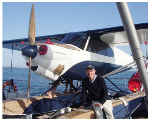
Cub Crafters CC-11 Engine Plugs