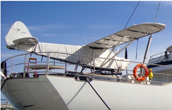
Cub Crafters CC-11 Complete Cover Set

WINTER USE MATERIAL - Made with Solution-Dyed Polyester fabric, this option is intended for seasonal use to aid in deicing, rain mitigation, or for occasional travel. The material is lighter and more compact, but more susceptible to UV damage and may have a shorter useful life if used continuously outside than the all-year use material.