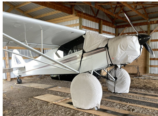
CubCrafters CC-11 Windshield, Engine & Tire Covers