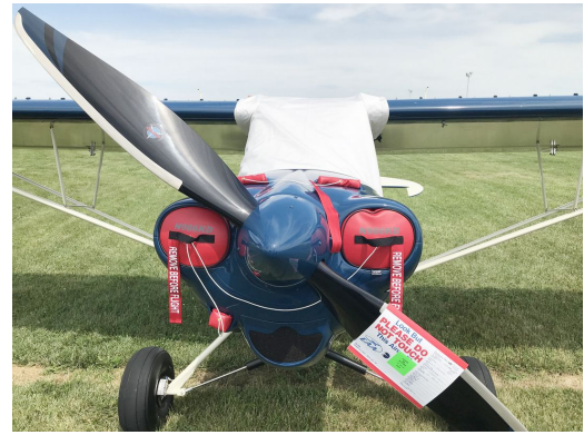
Cub Crafters EX2 Canopy Cover, Engine Plugs