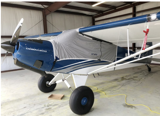
Cub Crafters Carbon Cub Travel Weight Canopy Cover

This cover type is made from Silver Acrylic Sunbrella canvas and is 100% lined with a soft and smooth microfiber. Bruce's Custom Covers developed this material combination especially for aircraft protection. The outer material is medium weight and treated for water resistance, UV resistance and anti-static buildup. The inner lining is a very soft and smooth microfiber to prevent scratching. The material is very reflective, and tests show that the cabin interior temperature can be reduced to near-ambient temperature on the hottest of days. It is water, ice and snow repellent, yet breathable to allow moisture to escape from between the cover and the aircraft surface.