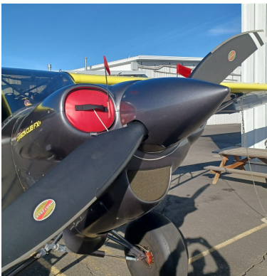
CubCrafters FX-3 Engine Inlet Plugs

Engine Inlet Plugs are custom fit for your CubCrafters CC-18, 19, 20, Top Cub, CCK-1865, CC-19 X-Cub, CCX-2000, EX-3, FX-3 intakes, made with heavy-duty vinyl material, and stuffed with a single block of sculpted urethane foam. Each plug has a zipper that allows the foam to be removed and dried if necessary. Engine plugs have warning flags that are visible from the cockpit or 'remove before flight' streamers sewn onto the face of the plugs. Most plugs are imprinted with the aircraft registration number in black for an extra charge. Storage bag NOT included. Engine plugs may be inserted after flight when the engine is still warm. Engine Inlet Plugs are commonly referred to as Cowl Plugs, Intake Plugs, Cowl Blocks, Engine Blocks, and Engine Bung.