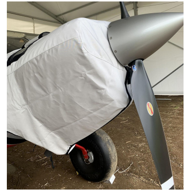
Cub Crafters CC-19 Engine Cover