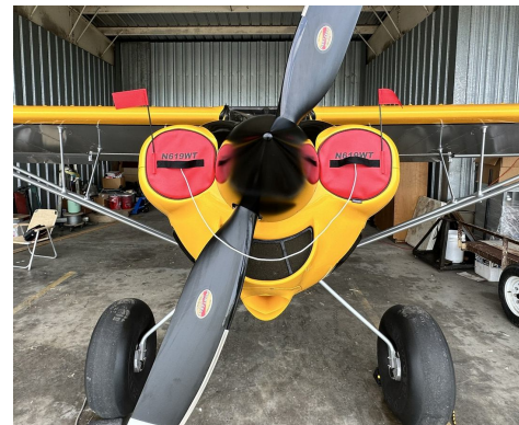
Cub Crafters CC-19 X-Cub Engine Plugs