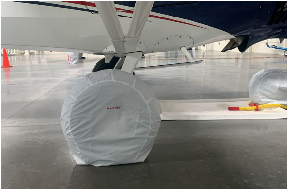
Cub Crafters Tire Covers, tricycle gear, test fit covers