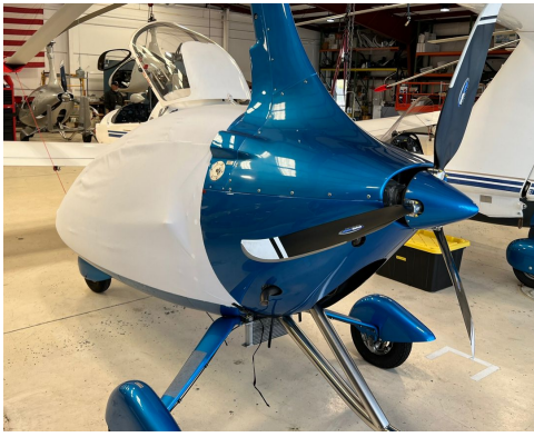
Autogyro Calidus Canopy/Nose Cover, test fit cover