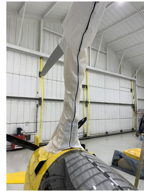
Calidus Gyrocopter Rotor Mast Cover, test fit cover