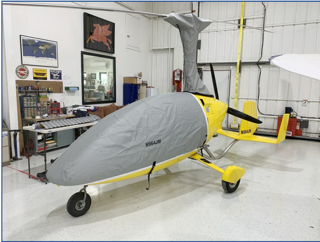
Autogyro Calidus Gyrocopter Canopy/Nose &amp; Rotor Hub/Mast Cover