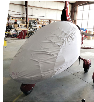
Cavalon Gyrocopter Bubble Cover, test fit cover