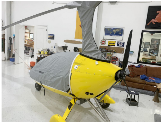
Autogyro Calidus Gyrocopter Canopy/Nose & Rotor Hub/Mast Cover

Travel Covers are made with Silver Solution-Dyed Polyester fabric and fully lined over the entire cover. The material is lightweight and more compact for easy storage in the aircraft. The polyester material is water resistant, but only intended for occasional use outside. We also have an ultra lightweight material available for fitted hangar dust covers. For daily outdoor use, the non-travel Sunbrella Cover is the best choice.