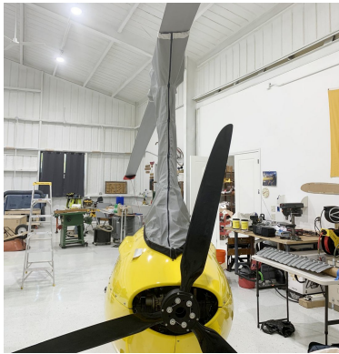
Autogyro Calidus Gyrocopter Rotor Hub/Mast Cover

Rotor Hub Covers overlaps with the Blade Covers to ensure complete protection for the entire main rotor system. Designed like a jacket with sleeves and no collar, the rotor hub cover fastens together below each blade with Delrin buckles. The Rotor Hub Cover is normally made from Solution-Dyed Polyester.