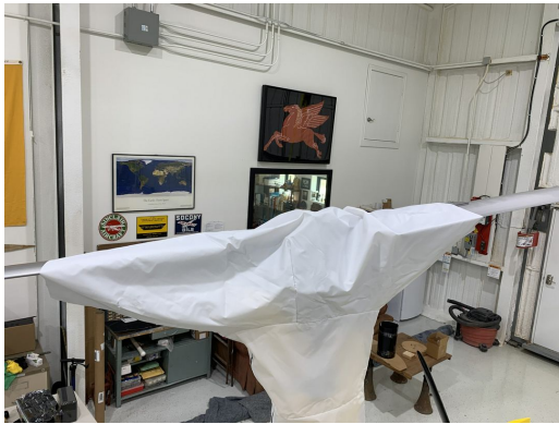
Calidus Gyrocopter Rotor Mast Cover, test fit cover

Rotor Hub Covers overlaps with the Blade Covers to ensure complete protection for the entire main rotor system. Designed like a jacket with sleeves and no collar, the rotor hub cover fastens together below each blade with Delrin buckles. The Rotor Hub Cover is normally made from Solution-Dyed Polyester.