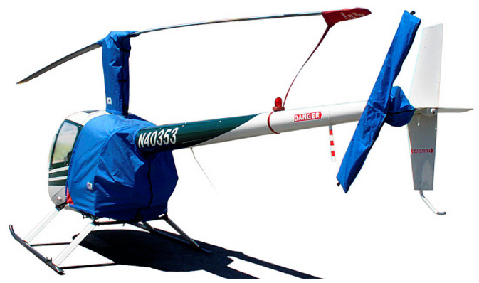
Robinson R-22 Engine, Rotor Mast & Tail Rotor Covers, with Blade Tie-down