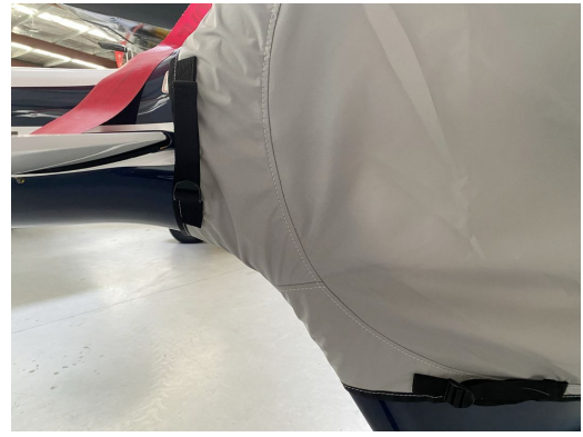
Guimbal Cabri G2 Tailfan Housing Fenestron Cover