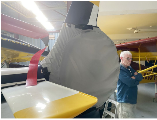
Guimbal Cabri G2 Tailfan Housing Fenestron Cover