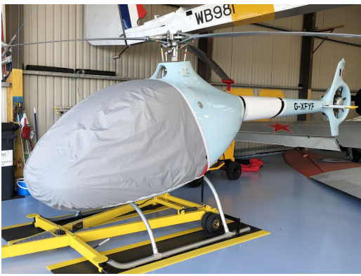
Cabri G2 Light Weight Travel Bubble Cover