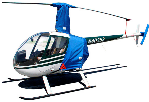
Robinson R-22 Engine, Rotor Mast & Tail Rotor Covers, with Blade Tie-down