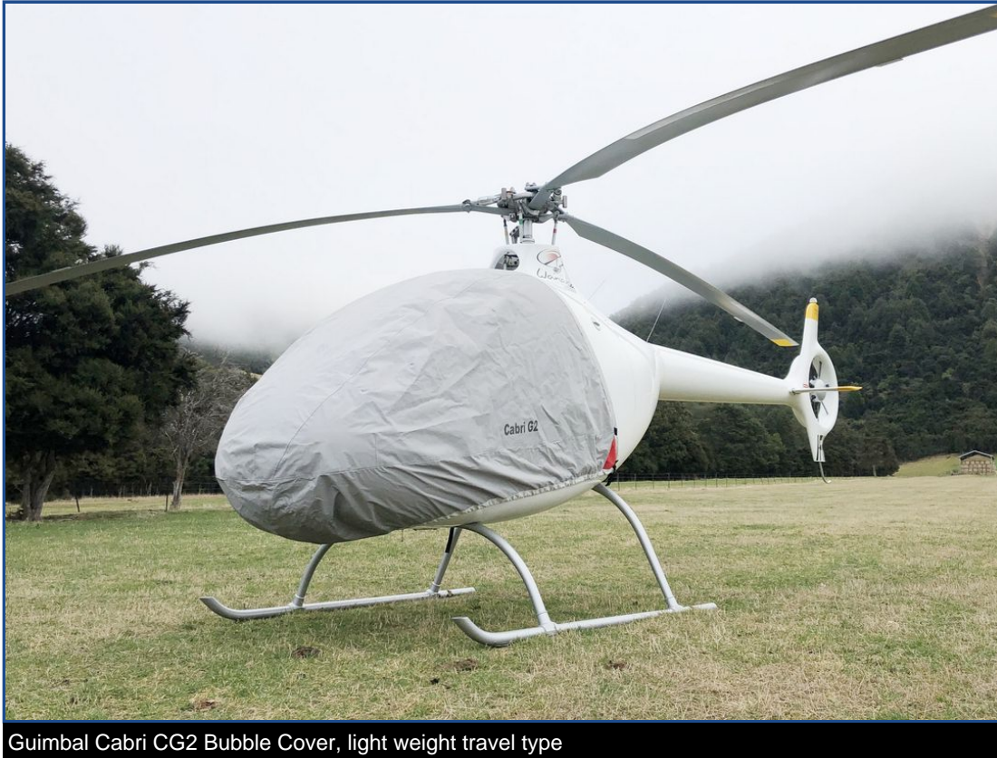
Guimbal Cabri CG2 Bubble Cover, light weight travel type