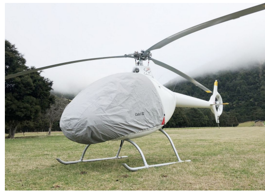
Guimbal Cabri CG2 Bubble Cover, light weight travel type