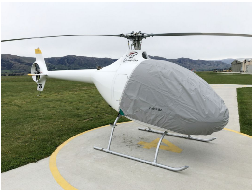
Guimbal Cabri CG2 Bubble Cover, light weight travel type

Travel Covers are made with Silver Solution-Dyed Polyester fabric and fully lined over the entire cover. The material is lightweight and more compact for easy storage in the aircraft. The polyester material is water resistant, but only intended for occasional use outside. We also have an ultra lightweight material available for fitted hangar dust covers. For daily outdoor use, the non-travel Sunbrella Cover is the best choice.