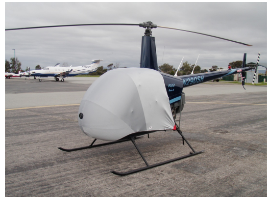
Robinson R-22 Light Weight Travel Cover