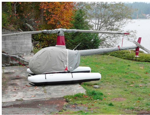
Robinson R-22 Bubble Cover (Ext. Past Rotor Hub), Engine Cover, Tailboom Cover, Blade Covers, Rotor Hub Cover, & Tail Rotor Gear Box Cover