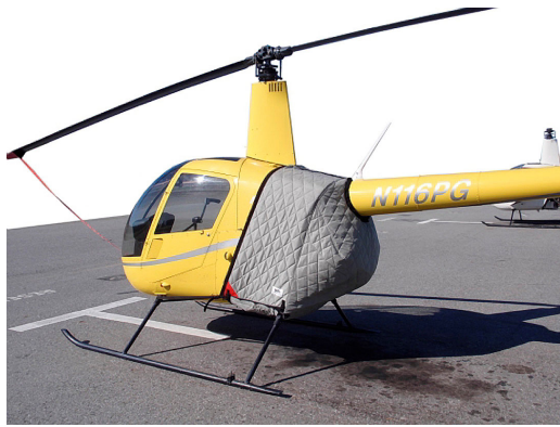
Robinson R-22 Insulated Engine Cover (also covers bottom) & Front Blade Tie-down

WINTER USE MATERIAL - Made with Solution-Dyed Polyester fabric, this option is intended for seasonal use to aid in deicing, rain mitigation, or for occasional travel. The material is lighter and more compact, but more susceptible to UV damage and may have a shorter useful life if used continuously outside than the all-year use material.