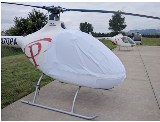
Guimbal Cabri G2 Bubble Cover, test fit cover