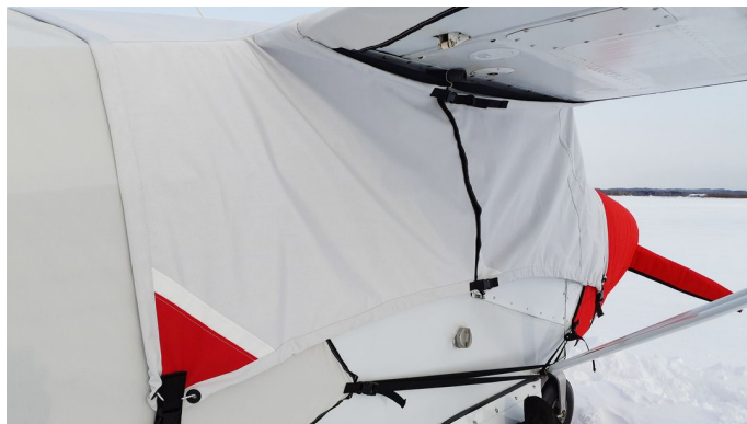
1957 PA-22-150 Empennage Cover (Tailboom, Vertical 7 Horizontal Stabilizers)