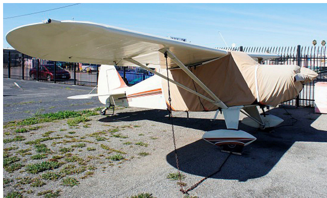
Piper PA-22-150 Pacer Extended Canopy, Engine & Prop/Spinner Covers

This cover type is made from Silver Acrylic Sunbrella canvas and is 100% lined with a soft and smooth microfiber. Bruce's Custom Covers developed this material combination especially for aircraft protection. The outer material is medium weight and treated for water resistance, UV resistance and anti-static buildup. The inner lining is a very soft and smooth microfiber to prevent scratching. The material is very reflective, and tests show that the cabin interior temperature can be reduced to near-ambient temperature on the hottest of days. It is water, ice and snow repellent, yet breathable to allow moisture to escape from between the cover and the aircraft surface.