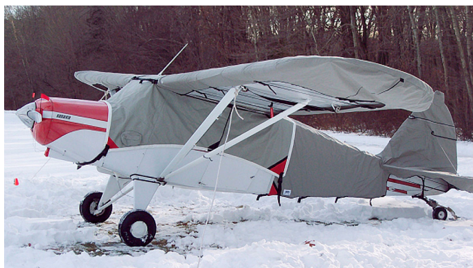
Piper Clipper Canopy Cover, Empennage & Wing Covers, Engine Plugs

WINTER USE MATERIAL - Made with Solution-Dyed Polyester fabric, this option is intended for seasonal use to aid in deicing, rain mitigation, or for occasional travel. The material is lighter and more compact, but more susceptible to UV damage and may have a shorter useful life if used continuously outside than the all-year use material.