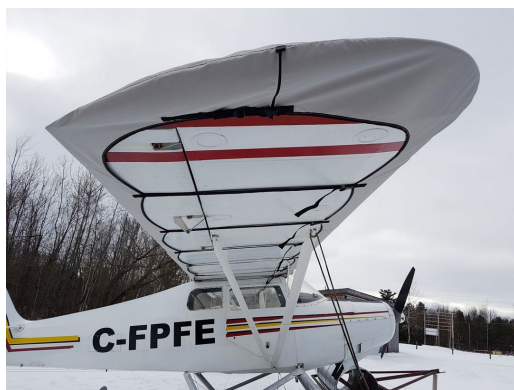
Christavia MK1 Wing Covers