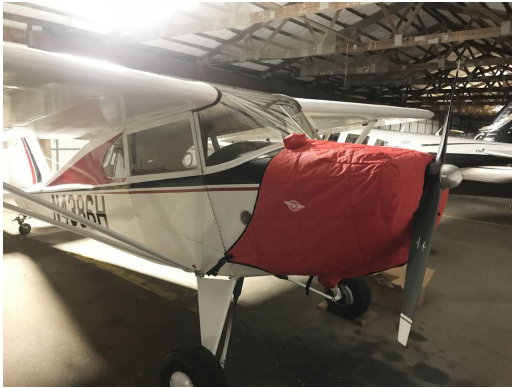
Piper PA-15 Vagabond Insulated Engine Cover

Insulated Covers Material - A special composite material of solution-dyed polyester, 3M Thinsulate insulation, and soft nylon interior fabric. Our insulated covers are designed to complement an engine preheater and help retain heat in the engine compartment after shutdown. If you operate your aircraft in cold-weather, these covers will help prevent engine wear and tear.