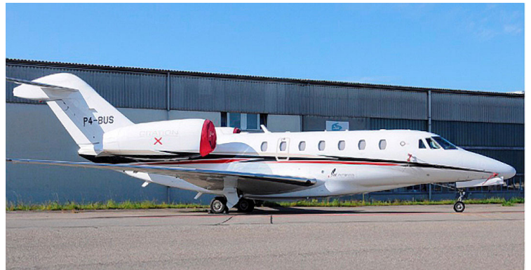
Citation X Intake & Pitot Tube Covers