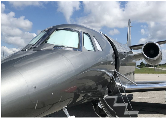
Cessna Citation 560XL Cockpit HeatShields