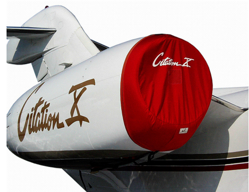
Citation X Intake Covers