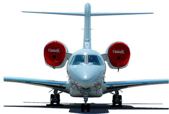
Citation X Intake Covers