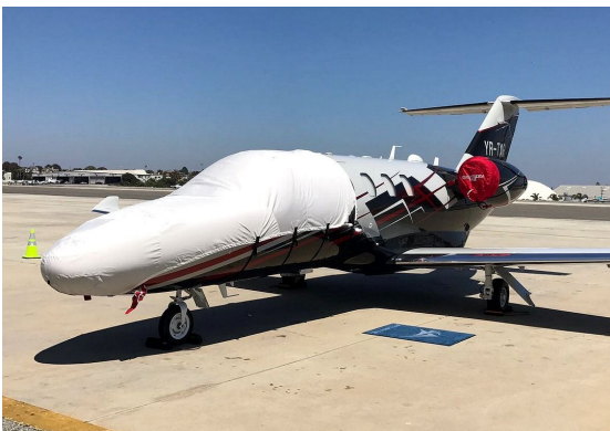
Citationjet CJ1 Cockpit/Nose Cover

Travel Covers are made with Silver Solution-Dyed Polyester fabric and only lined over the windshield to save weight. The material is lightweight and more compact for easy stowage in the aircraft. The polyester material is water resistant, but only intended for occasional use outside. We also have an ultra lightweight material available for fitted hangar dust covers. For daily outdoor use, the non-travel Sunbrella Cover is the best choice.