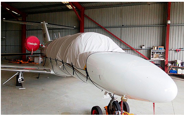
Citation CJ-1 Canopy Cover and Engine Covers

Travel Covers are made with Silver Solution-Dyed Polyester fabric and only lined over the windshield to save weight. The material is lightweight and more compact for easy stowage in the aircraft. The polyester material is water resistant, but only intended for occasional use outside. We also have an ultra lightweight material available for fitted hangar dust covers. For daily outdoor use, the non-travel Sunbrella Cover is the best choice.