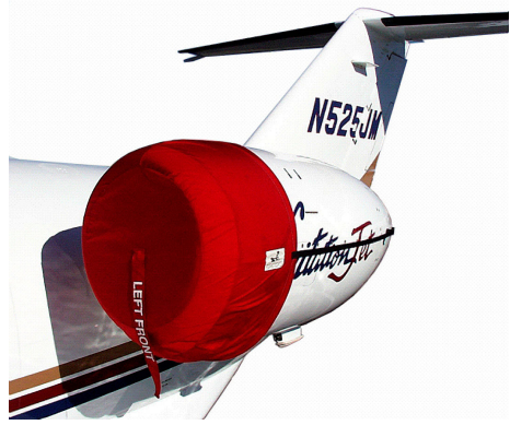
Engine Inlet Cover