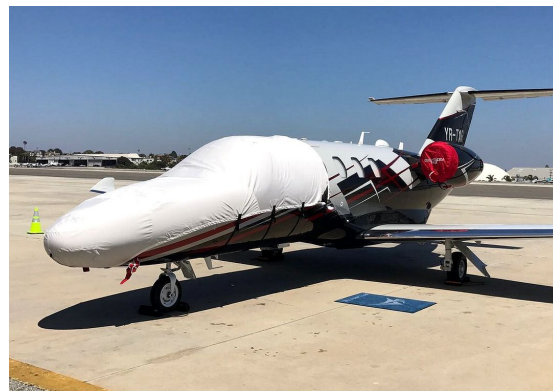
Citationjet CJ1 Cockpit/Nose Cover