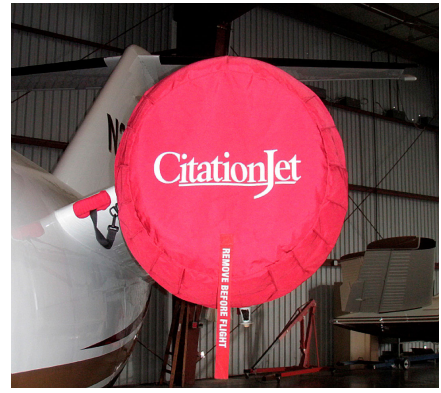
Cessna Citation Engine Cover Set