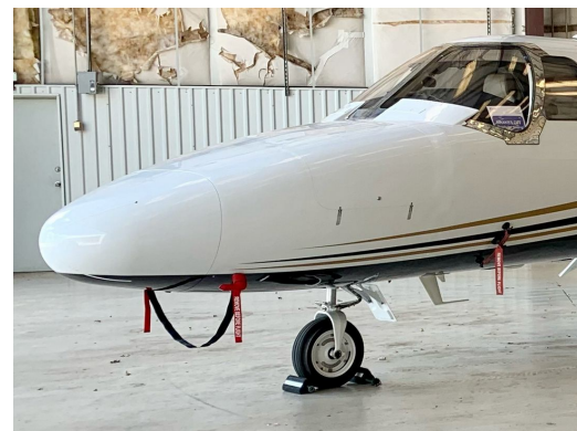
Cessna Citationjet CJ1 Pitot Cover Set