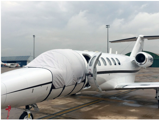
Cessna Citationjet 525A, CJ-2, & CJ2+ Cockpit Cover