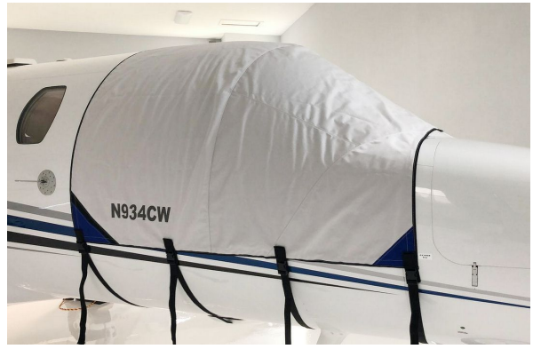
Cessna Citation M2 Cockpit Cover