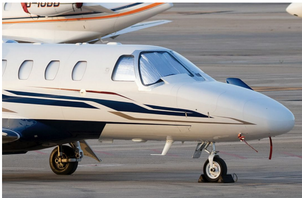
Cessna Citationjet 525, CJ-I, CJ1+, & M2 Cockpit Heatshields

Custom-made Heatshield Sunshades are available for almost any window in the jet. Side windows, Skylights, and Emergency Exits are all custom-made. The product is a unique composite of closed-cell foam with a silver mylar finish. The set is easily stored in the included storage sleeve. Some designs may require velcro and suction cups. Our Heatshields are offered white side out since aircraft manufacturers have issued advisories against reflective window inserts due to potential heat damage.