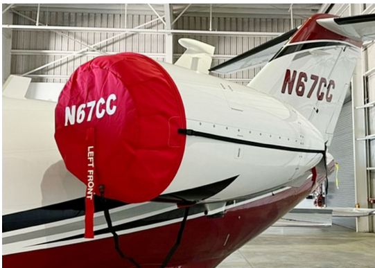
Cessna 525A engine inlet covers & exhaust plugs

The Cessna Citationjet 525A, CJ-2, & CJ2+ Intake/Exhaust Plugs are custom fit for the intake and exhaust openings, made with heavy-duty vinyl material, and stuffed with a single block of sculpted urethane foam. Each plug has a zipper that allows the foam to be removed and dried if necessary. Engine plugs have 'remove before flight' streamers sewn onto the face of the plugs. Most plugs are imprinted with the aircraft registration number in black. Engine plugs may be inserted after flight when the engine is still warm. Engine Inlet Plugs are commonly referred to as Cowl Plugs, Intake Plugs, Cowl Blocks, Engine Blocks, and Engine Bungs.