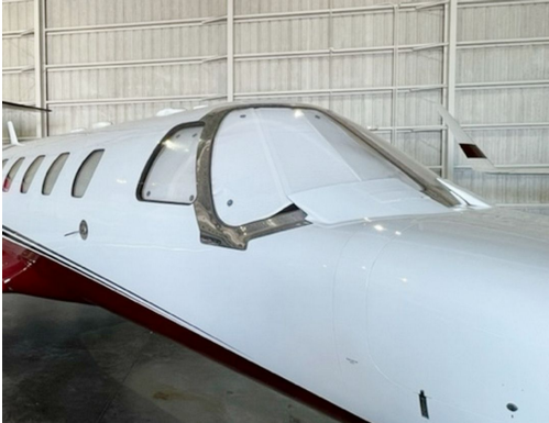
Cessna 525A Cockpit heatshields