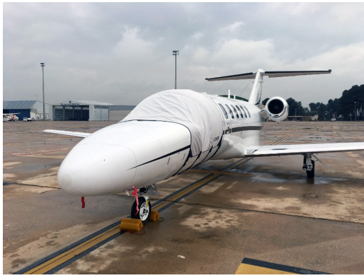
Cessna Citationjet 525A, CJ-2, & CJ2+ Cockpit Cover