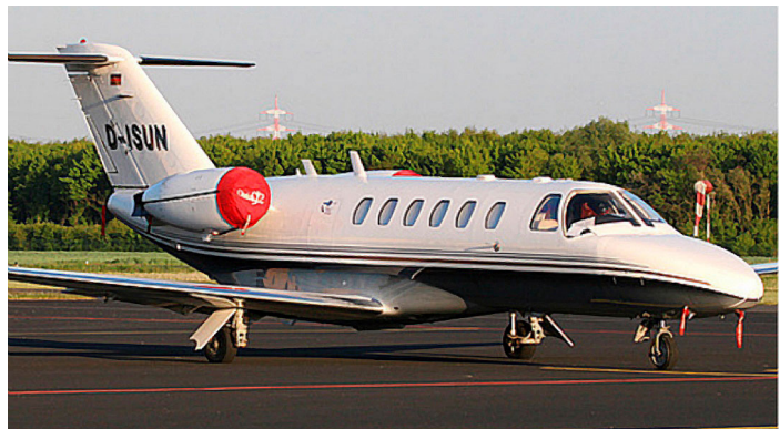
Engine Inlet/Exhaust Covers