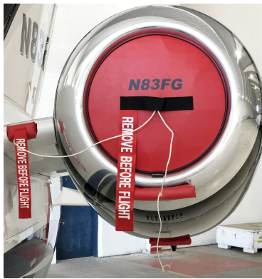
Cessna Citation Mustang 510 Engine Plugs

The Engine Inlet Plugs are custom fit for your Cessna Citationjet 525A, CJ-2, & CJ2+ intakes, made with heavy-duty vinyl material, and stuffed with a single block of sculpted urethane foam. Each plug has a zipper that allows the foam to be removed and dried if necessary. Engine plugs have 'remove before flight' streamers sewn onto the face of the plugs. Most plugs are imprinted with the aircraft registration number in black for an extra charge. Storage bag NOT included. Engine plugs may be inserted after flight when the engine is still warm. Engine Inlet Plugs are commonly referred to as Cowl Plugs, Intake Plugs, Cowl Blocks, Engine Blocks, and Engine Bunges.