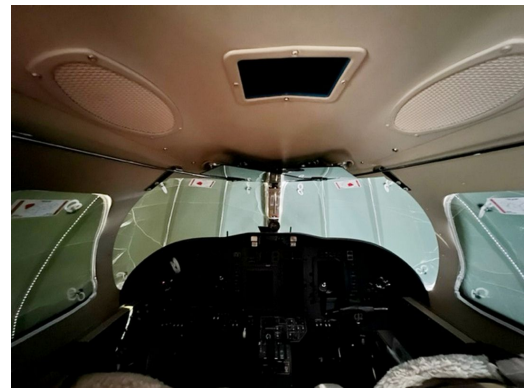
Cessna 525A Cockpit heatshields