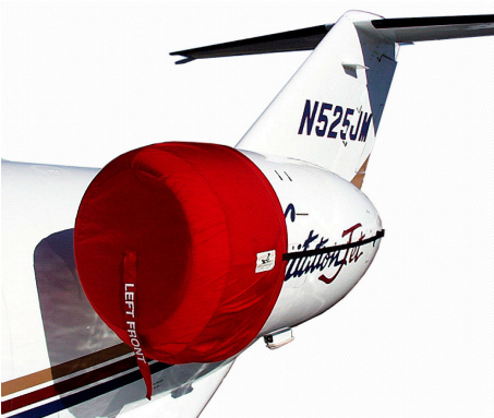
Engine Inlet Cover

The Cessna Citationjet 525A, CJ-2, & CJ2+ Intake/Exhaust Plugs are custom fit for the intake and exhaust openings, made with heavy-duty vinyl material, and stuffed with a single block of sculpted urethane foam. Each plug has a zipper that allows the foam to be removed and dried if necessary. Engine plugs have 'remove before flight' streamers sewn onto the face of the plugs. Most plugs are imprinted with the aircraft registration number in black. Engine plugs may be inserted after flight when the engine is still warm. Engine Inlet Plugs are commonly referred to as Cowl Plugs, Intake Plugs, Cowl Blocks, Engine Blocks, and Engine Bungs.