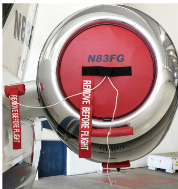
Cessna Citation Mustang 510 Engine Plugs

The Engine Inlet Plugs are custom fit for your Cessna Citationjet 525A, CJ-2, & CJ2+ intakes, made with heavy-duty vinyl material, and stuffed with a single block of sculpted urethane foam. Each plug has a zipper that allows the foam to be removed and dried if necessary. Engine plugs have 'remove before flight' streamers sewn onto the face of the plugs. Most plugs are imprinted with the aircraft registration number in black for an extra charge. Storage bag NOT included. Engine plugs may be inserted after flight when the engine is still warm. Engine Inlet Plugs are commonly referred to as Cowl Plugs, Intake Plugs, Cowl Blocks, Engine Blocks, and Engine Bunges.