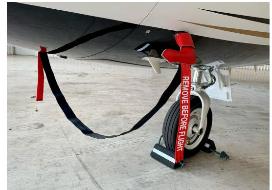
Cessna Citationjet CJ1 Pitot Cover Set