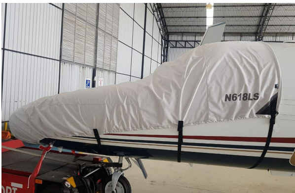
Citationjet 525B Cockpit/Nose Cover

This cover type is made from Silver Acrylic Sunbrella canvas and is 100% lined with a soft and smooth microfiber. Bruce's Custom Covers developed this material combination especially for aircraft protection. The outer material is medium weight and treated for water resistance, UV resistance and anti-static buildup. The inner lining is a very soft and smooth microfiber to prevent scratching. The material is very reflective, and tests show that the cabin interior temperature can be reduced to near-ambient temperature on the hottest of days. It is water, ice and snow repellent, yet breathable to allow moisture to escape from between the cover and the aircraft surface.