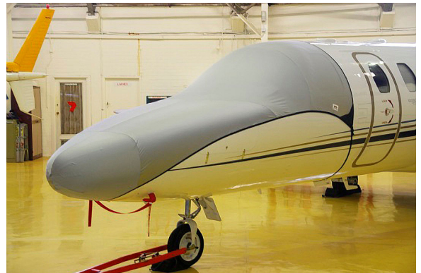
Citationjet CJ3 Cockpit/Nose Travel Cover