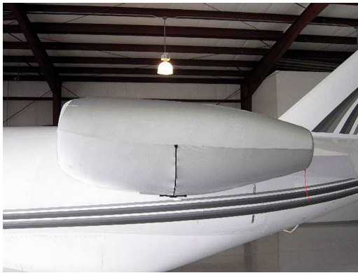
Citation CJ3 Bikini Style Engine Cover Set, full nacelle enclosure

The Cessna Citationjet 525B, CJ-3 Intake/Exhaust Plugs are custom fit for the intake and exhaust openings, made with heavy-duty vinyl material, and stuffed with a single block of sculpted urethane foam. Each plug has a zipper that allows the foam to be removed and dried if necessary. Engine plugs have 'remove before flight' streamers sewn onto the face of the plugs. Most plugs are imprinted with the aircraft registration number in black. Engine plugs may be inserted after flight when the engine is still warm. Engine Inlet Plugs are commonly referred to as Cowl Plugs, Intake Plugs, Cowl Blocks, Engine Blocks, and Engine Bungs.