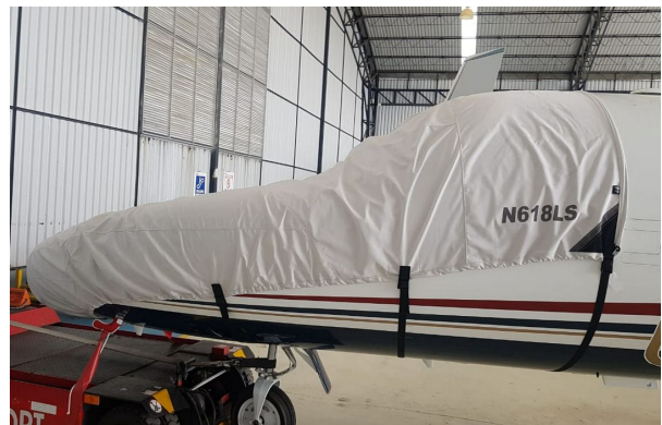
Citationjet 525B Cockpit/Nose Cover