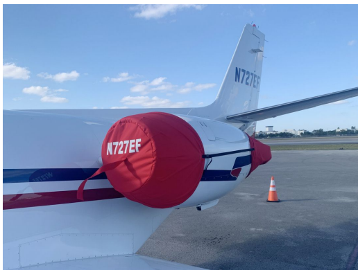
Cessna Citation S550

The Cessna Citationjet 525B, CJ-3 Intake/Exhaust Plugs are custom fit for the intake and exhaust openings, made with heavy-duty vinyl material, and stuffed with a single block of sculpted urethane foam. Each plug has a zipper that allows the foam to be removed and dried if necessary. Engine plugs have 'remove before flight' streamers sewn onto the face of the plugs. Most plugs are imprinted with the aircraft registration number in black. Engine plugs may be inserted after flight when the engine is still warm. Engine Inlet Plugs are commonly referred to as Cowl Plugs, Intake Plugs, Cowl Blocks, Engine Blocks, and Engine Bungs.