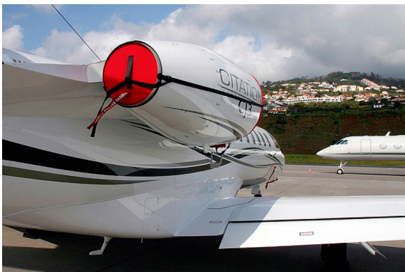
Citation CJ3 Exhaust Plug

The Engine Inlet Plugs are custom fit for your Cessna Citationjet 525B, CJ-3 intakes, made with heavy-duty vinyl material, and stuffed with a single block of sculpted urethane foam. Each plug has a zipper that allows the foam to be removed and dried if necessary. Engine plugs have 'remove before flight' streamers sewn onto the face of the plugs. Most plugs are imprinted with the aircraft registration number in black for an extra charge. Storage bag NOT included. Engine plugs may be inserted after flight when the engine is still warm. Engine Inlet Plugs are commonly referred to as Cowl Plugs, Intake Plugs, Cowl Blocks, Engine Blocks, and Engine Bungs.