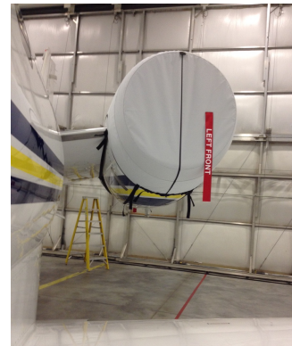
Cessna Citation 560XL Upper Nacelle/Brightwork Covers