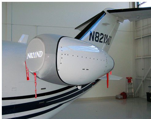
Cessna 510 Mustang Bikini Type Engine Cover