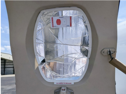
Citationjet Entrance Door Heatshield

Custom-made Heatshield Sunshades are available for almost any window in the jet. Side windows, Skylights, and Emergency Exits are all custom-made. The product is a unique composite of closed-cell foam with a silver mylar finish. The set is easily stored in the included storage sleeve. Some designs may require velcro and suction cups. Our Heatshields are offered white side out since aircraft manufacturers have issued advisories against reflective window inserts due to potential heat damage.