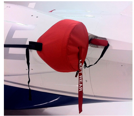
Citation CJ3 Exhaust Cover