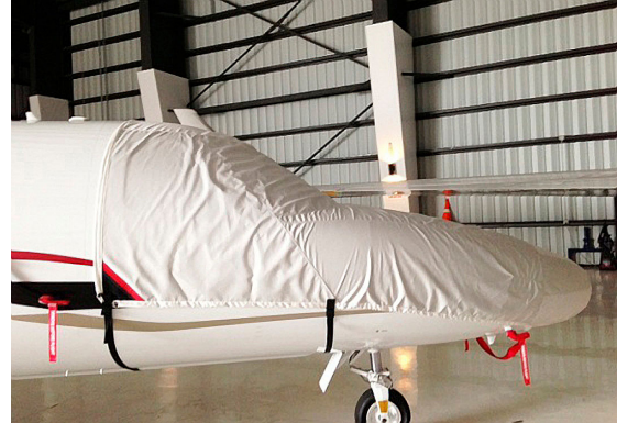
Cessna Citationjet 525B Travel Weight Cockpit/Nose Cover Citation CJ4 Cockpit/Nose Cover and Heat Resistant Pitot Covers set