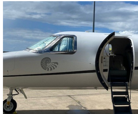
Cessna Citationjet CJ2 Cockpit HeatShields