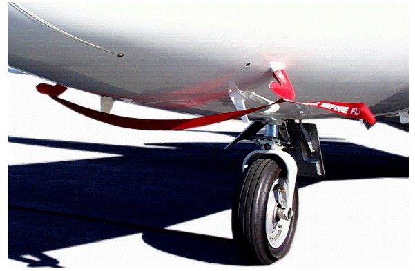
Cessna Citationjet 525C, CJ-4 Pitot, Aoa Cover Set, Heat Resistant Type