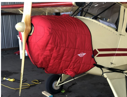
Taylorcraft Insulated Engine Cover

This cover type is made from Silver Acrylic Sunbrella canvas and is 100% lined with a soft and smooth microfiber. Bruce's Custom Covers developed this material combination especially for aircraft protection. The outer material is medium weight and treated for water resistance, UV resistance and anti-static buildup. The inner lining is a very soft and smooth microfiber to prevent scratching. The material is very reflective, and tests show that the cabin interior temperature can be reduced to near-ambient temperature on the hottest of days. It is water, ice and snow repellent, yet breathable to allow moisture to escape from between the cover and the aircraft surface.