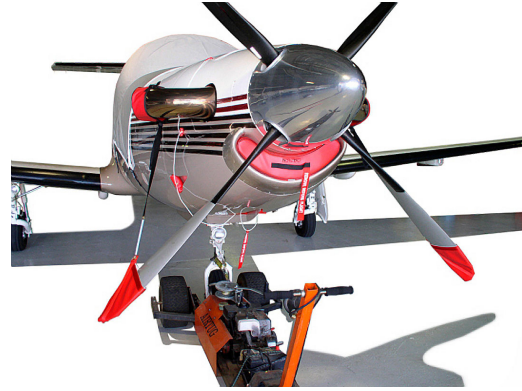
Pilatus PC-12 LARGE ENGINE INLET PLUG, SMALL PLUGS SET, Prop Tie/Exhaust Covers