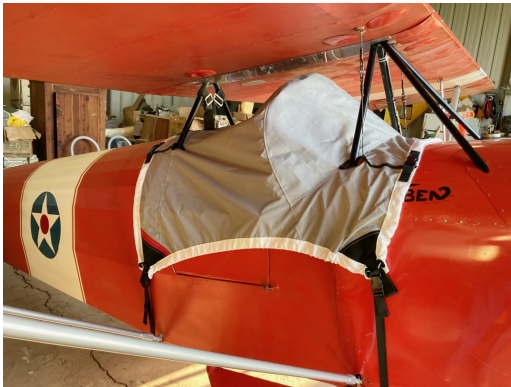
Corben Junior Ace Travel Weight Canopy Cover

This cover type is made from Silver Acrylic Sunbrella canvas and is 100% lined with a soft and smooth microfiber. Bruce's Custom Covers developed this material combination especially for aircraft protection. The outer material is medium weight and treated for water resistance, UV resistance and anti-static buildup. The inner lining is a very soft and smooth microfiber to prevent scratching. The material is very reflective, and tests show that the cabin interior temperature can be reduced to near-ambient temperature on the hottest of days. It is water, ice and snow repellent, yet breathable to allow moisture to escape from between the cover and the aircraft surface.