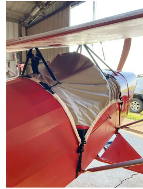
Corben Junior Ace Travel Weight Canopy Cover