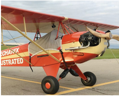
Corben Baby Ace Cockpit Cover

the hottest of days. It is water, ice and snow repellent, yet breathable to allow moisture to escape from between the cover and the aircraft surface.