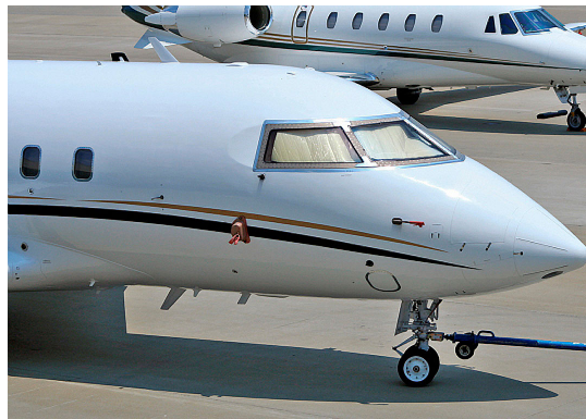
Challenger 604 Cockpit HeatShields

Cockpit Heatshields are interior sunshades for the aircraft's cockpit. The product is a unique composite of closed-cell foam with a silver mylar finish. The semi-rigid design is stiff enough to stand inside the window framing. The set folds up flat and is easily stored in the included storage sleeve. Some designs may require velcro and suction cups. Our Heatshields for jets are offered white side out because some aircraft manufacturers have issued advisories against reflective window inserts due to potential heat damage. A Heatshield is an excellent short-term remedy for cockpit overheating, but an external fabric cover is more effective for long-term protection.