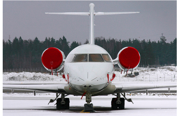
Challenger 604 Intake Covers, OEM design