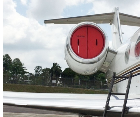
Grumman Gulfstream G450 Intake Plugs