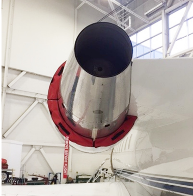
Canadair Challenger 604 Bypass Plugs

The Engine Inlet Plugs are custom fit for your Canadair Regional Jet 200, 700 intakes, made with heavy-duty vinyl material, and stuffed with a single block of sculpted urethane foam. Each plug has a zipper that allows the foam to be removed and dried if necessary. Engine plugs have 'remove before flight' streamers sewn onto the face of the plugs. Most plugs are imprinted with the aircraft registration number in black for an extra charge. Storage bag NOT included. Engine plugs may be inserted after flight when the engine is still warm. Engine Inlet Plugs are commonly referred to as Cowl Plugs, Intake Plugs, Cowl Blocks, Engine Blocks, and Engine Bungs.