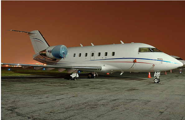
Challenger 601 Intake Covers, standard design

The Canadair Regional Jet 200, 700 Bikini Style Engine Covers are a single-piece design using a soft and smooth stretchy and fabric. The cover stretches tightly over both the intake and exhaust, installing quickly and easily. These covers are designed to be used as hangar dust covers and have a useful life of approximately one year.