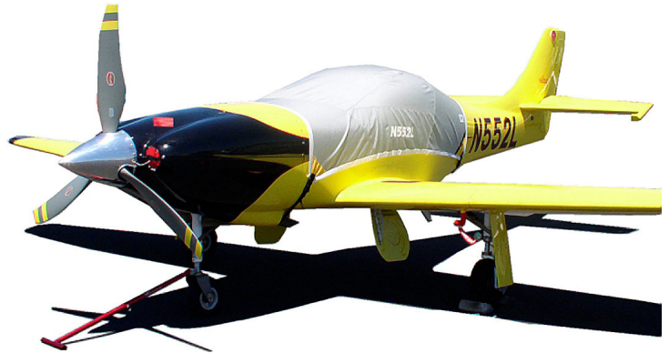
Canopy Cover for Lancair Legacy