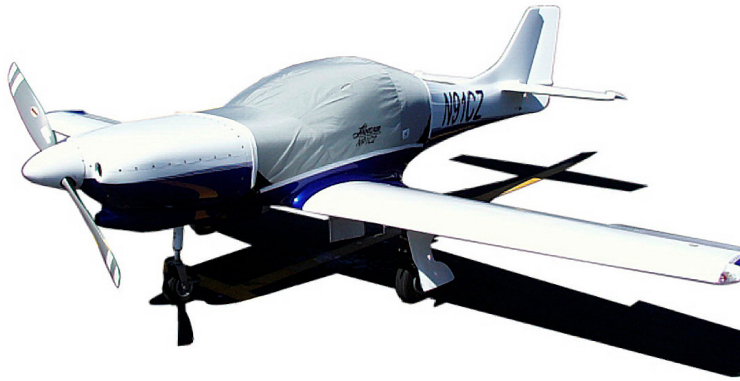
Canopy Cover for Lancair 320/360

The material is very reflective, and tests show that the cabin interior temperature can be reduced to near-ambient temperature on the hottest of days. It is water, ice and snow repellent, yet breathable to allow moisture to escape from between the cover and the aircraft surface.