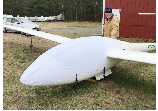
Grob 102 Astir CS Canopy/Nose Cover (test fit)