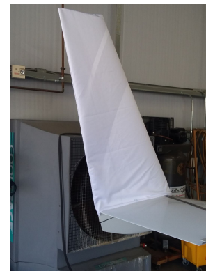
Velocity Vertical Stabilizer Covers, test fit cover