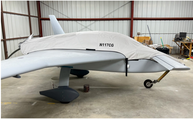
Cozy All Models Canopy/Nose/Engine Cover, Mark Iii & Iv Models

water resistance, UV resistance and anti-static buildup. The inner lining is a very soft and smooth microfiber to prevent scratching. The material is very reflective, and tests show that the cabin interior temperature can be reduced to near-ambient temperature on the hottest of days. It is water, ice and snow repellent, yet breathable to allow moisture to escape from between the cover and the aircraft surface.