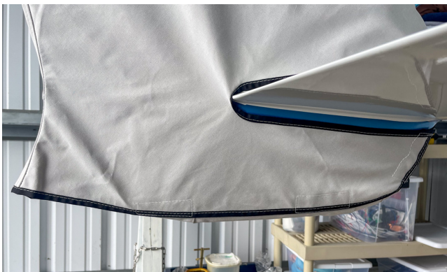
Cozy All Models Vertical Stabilizer Covers, All Year Use

WINTER USE MATERIAL - Made with Solution-Dyed Polyester fabric, this option is intended for seasonal use to aid in deicing, rain mitigation, or for occasional travel. The material is lighter and more compact, but more susceptible to UV damage and may have a shorter useful life if used continuously outside than the all-year use material.