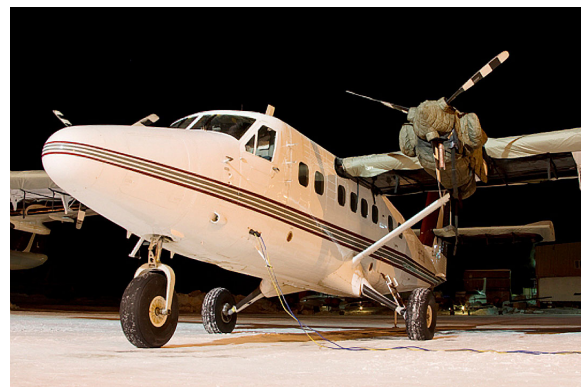
Twin Otter Wing, Horiz. Stab & Engine Covers