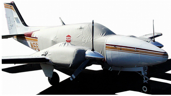
Standard Canopy Cover & Engine Plugs. Extended Canopy Cover & Engine Cover