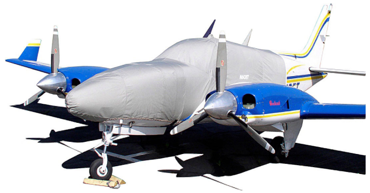
Baron Canopy/Nose Cover