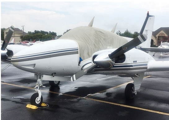
Beech Baron Canopy Cover

This cover type is made from Silver Acrylic Sunbrella canvas and is 100% lined with a soft and smooth microfiber. Bruce's Custom Covers developed this material combination especially for aircraft protection. The outer material is medium weight and treated for water resistance, UV resistance and anti-static buildup. The inner lining is a very soft and smooth microfiber to prevent scratching. The material is very reflective, and tests show that the cabin interior temperature can be reduced to near-ambient temperature on the hottest of days. It is water, ice and snow repellent, yet breathable to allow moisture to escape from between the cover and the aircraft surface.