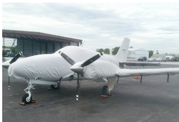
Full Cover Set (58P-020, 58P-225, 58P-405)