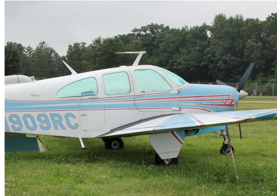
Beech Bonanza/Debonair HeatShield Set