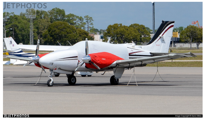
Beech Baron 58, G58 Canopy Cover, Insulated Engine Covers