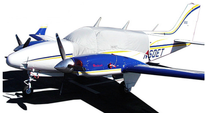
Standard Canopy Cover & Engine Plugs