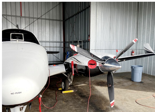
Baron 58 Engine Plugs