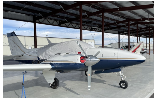
Beech Baron D55 Canopy Cover, Engine Plugs