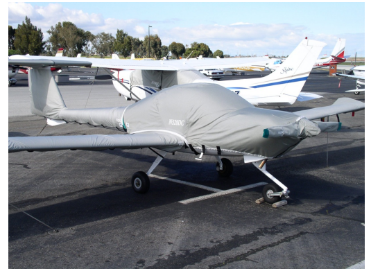
DA-20 Full Cover Set