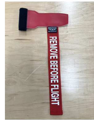
Pitot Tube Cover