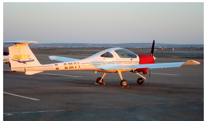
Diamond DA-20 Insulated Engine Cover