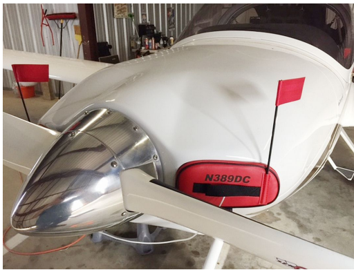
Diamond DA-20-C1 Engine Inlet Plugs

Engine Inlet Plugs are custom fit for your Diamond DA-20, Katana, Eclipse intakes, made with heavy-duty vinyl material, and stuffed with a single block of sculpted urethane foam. Each plug has a zipper that allows the foam to be removed and dried if necessary. Engine plugs have warning flags that are visible from the cockpit or 'remove before flight' streamers sewn onto the face of the plugs. Most plugs are imprinted with the aircraft registration number in black for an extra charge. Storage bag NOT included. Engine plugs may be inserted after flight when the engine is still warm. Engine Inlet Plugs are commonly referred to as Cowl Plugs, Intake Plugs, Cowl Blocks, Engine Blocks, and Engine Bungs.