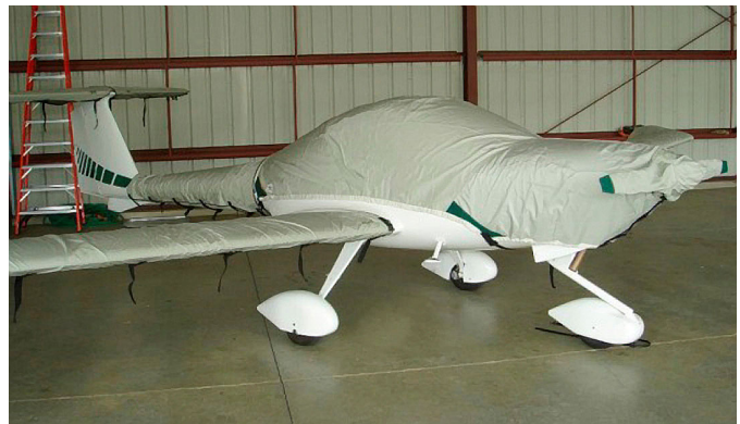
DA-20 Canopy/Engine, Prop/Spinner, Wing, Tailboom, Horiz. Stab. Covers