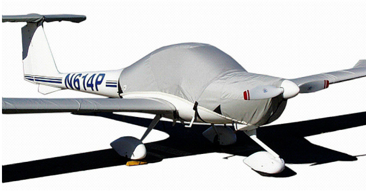
Diamond DA-20 Canopy/Engine, Wing & Horiz. Stab. Covers