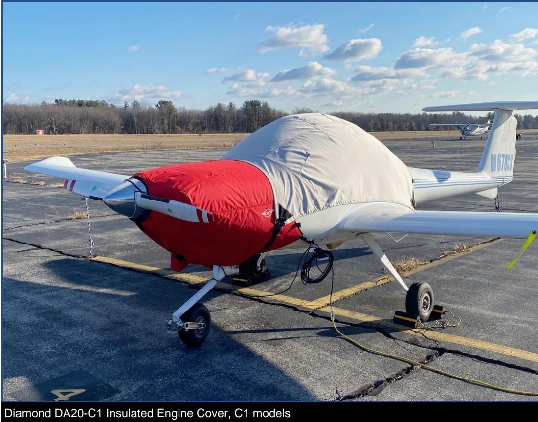
Diamond DA20-C1 Insulated Engine Cover, C1 models