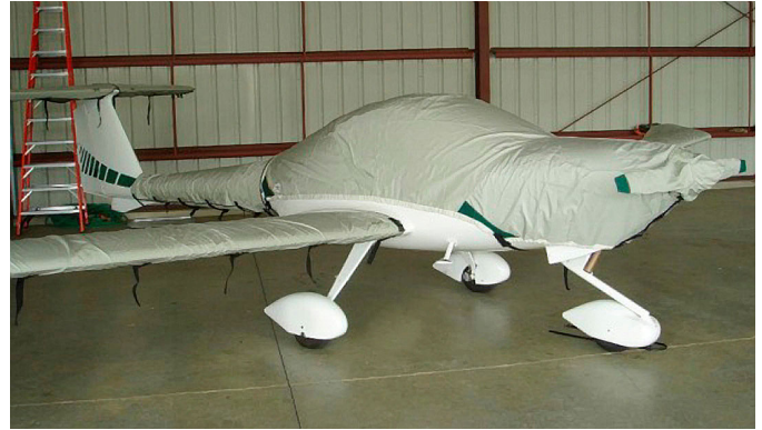
DA-20 Canopy/Engine, Prop/Spinner, Wing, Tailboom, Horiz. Stab. Covers