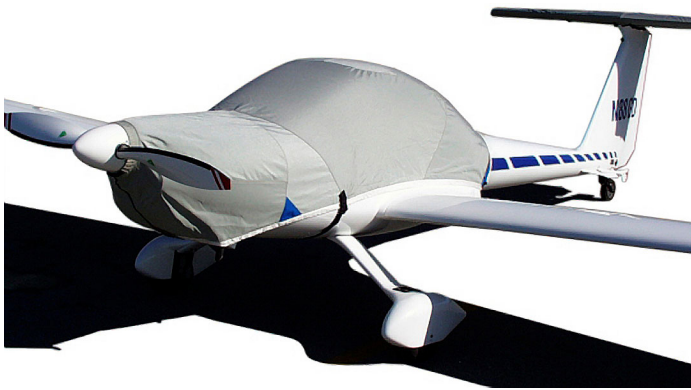
Diamond DA-20 Canopy/Engine Cover

This cover type is made from Silver Acrylic Sunbrella canvas and is 100% lined with a soft and smooth microfiber. Bruce's Custom Covers developed this material combination especially for aircraft protection. The outer material is medium weight and treated for water resistance, UV resistance and anti-static buildup. The inner lining is a very soft and smooth microfiber to prevent scratching. The material is very reflective, and tests show that the cabin interior temperature can be reduced to near-ambient temperature on the hottest of days. It is water, ice and snow repellent, yet breathable to allow moisture to escape from between the cover and the aircraft surface.