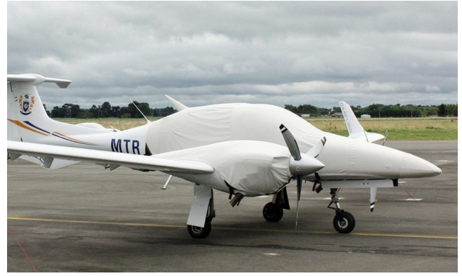
DA-42 (Lycoming Engine) Extended Canopy/Nose Cover, Engine Covers