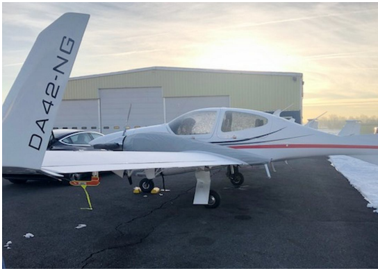
Diamond DA-42 Twin Star Travel Cover, Light Weight Travel Engine Covers, Specify Engine Type