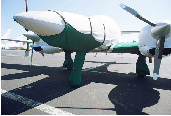
Diamond DA-42 Twinstar Landing Gear & Gearwell Covers