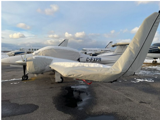
Diamond DA-42 Canopy, Wing, Engine & Horizontal Stabilizer Covers

WINTER USE MATERIAL - Made with Solution-Dyed Polyester fabric, this option is intended for seasonal use to aid in deicing, rain mitigation, or for occasional travel. The material is lighter and more compact, but more susceptible to UV damage and may have a shorter useful life if used continuously outside than the all-year use material.