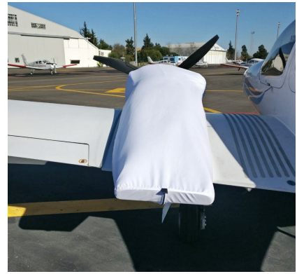
DA42 MPP Guardian (DA42-NG) Engine Cover, test fit cover