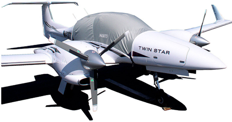
Twinstar Standard Canopy Cover