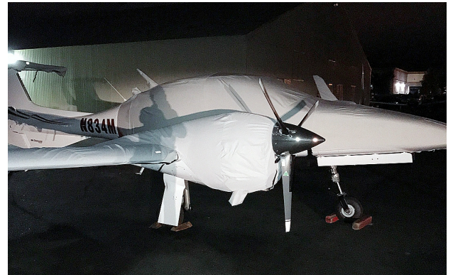
Diamond DA-42 Twin Star Wing & Engine Covers