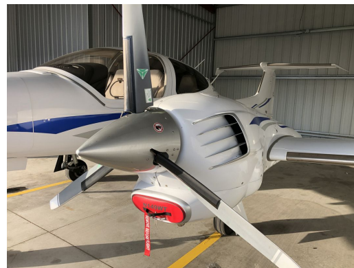
Diamond DA-42 Engine Inlet Plugs