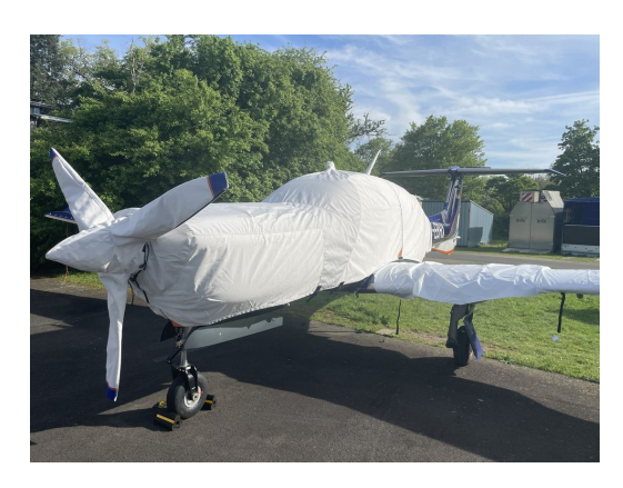
Diamond DA-50 Extended Canopy/Engine, Prop & Wing Covers (test fit)