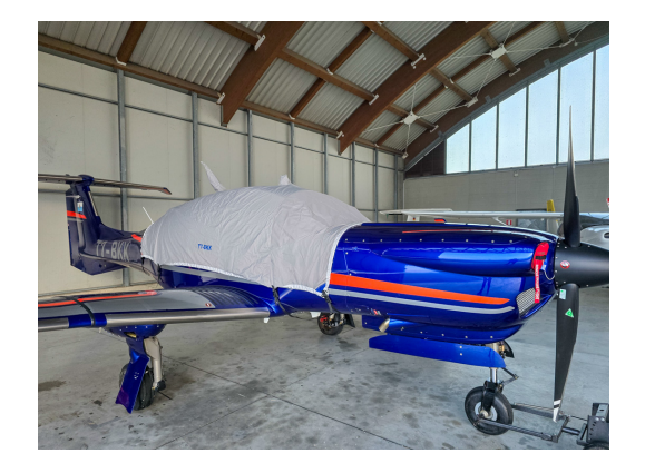
Diamond DA-50 Canopy Cover, Engine Plugs

Engine Inlet Plugs are custom fit for your Diamond DA-50 Superstar intakes, made with heavy-duty vinyl material, and stuffed with a single block of sculpted urethane foam. Each plug has a zipper that allows the foam to be removed and dried if necessary. Engine plugs have warning flags that are visible from the cockpit or 'remove before flight' streamers sewn onto the face of the plugs. Most plugs are imprinted with the aircraft registration number in black for an extra charge. Storage bag NOT included. Engine plugs may be inserted after flight when the engine is still warm. Engine Inlet Plugs are commonly referred to as Cowl Plugs, Intake Plugs, Cowl Blocks, Engine Blocks, and Engine Bungs.