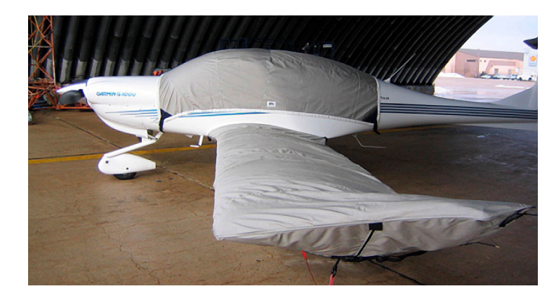
Diamond DA-40 Canopy & Wing Covers