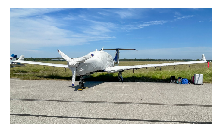
Diamond DA-50 Extended Canopy/Engine Cover, Wing & Prop Covers

WINTER USE MATERIAL - Made with Solution-Dyed Polyester fabric, this option is intended for seasonal use to aid in deicing, rain mitigation, or for occasional travel. The material is lighter and more compact, but more susceptible to UV damage and may have a shorter useful life if used continuously outside than the all-year use material.