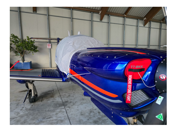
Diamond DA-50 Canopy Cover, Engine Plugs