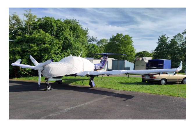
Diamond DA-50 Extended Canopy/Engine, Prop & Wing Covers (test fit)

This cover type is made from Silver Acrylic Sunbrella canvas and is 100% lined with a soft and smooth microfiber. Bruce's Custom Covers developed this material combination especially for aircraft protection. The outer material is medium weight and treated for water resistance, UV resistance and anti-static buildup. The inner lining is a very soft and smooth microfiber to prevent scratching. The material is very reflective, and tests show that the cabin interior temperature can be reduced to near-ambient temperature on the hottest of days. It is water, ice and snow repellent, yet breathable to allow moisture to escape from between the cover and the aircraft surface.