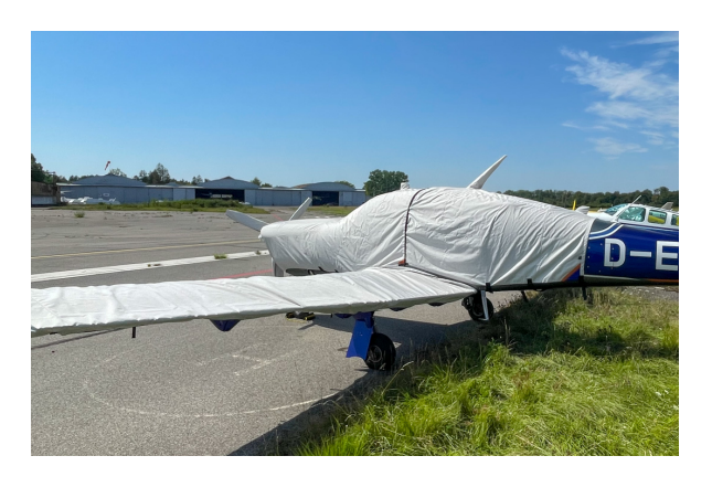
Diamond DA-50 Extended Canopy/Engine Cover, Wing Covers