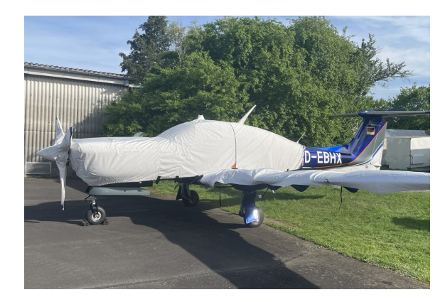
Diamond DA-50 Extended Canopy/Engine, Prop & Wing Covers (test fit)

This cover type is made from Silver Acrylic Sunbrella canvas and is 100% lined with a soft and smooth microfiber. Bruce's Custom Covers developed this material combination especially for aircraft protection. The outer material is medium weight and treated for water resistance, UV resistance and anti-static buildup. The inner lining is a very soft and smooth microfiber to prevent scratching. The material is very reflective, and tests show that the cabin interior temperature can be reduced to near-ambient temperature on the hottest of days. It is water, ice and snow repellent, yet breathable to allow moisture to escape from between the cover and the aircraft surface.