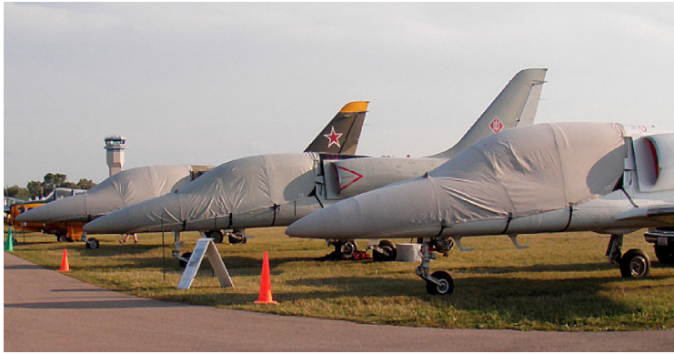
L-39 Canopy/Nose Covers & Plugs

This cover type is made from Silver Acrylic Sunbrella canvas and is 100% lined with a soft and smooth microfiber. Bruce's Custom Covers developed this material combination especially for aircraft protection. The outer material is medium weight and treated for water resistance, UV resistance and anti-static buildup. The inner lining is a very soft and smooth microfiber to prevent scratching. The material is very reflective, and tests show that the cabin interior temperature can be reduced to near-ambient temperature on the hottest of days. It is water, ice and snow repellent, yet breathable to allow moisture to escape from between the cover and the aircraft surface.