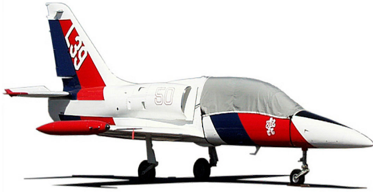
Canopy Cover for Aero L-39 Albatros

This cover type is made from Silver Acrylic Sunbrella canvas and is 100% lined with a soft and smooth microfiber. Bruce's Custom Covers developed this material combination especially for aircraft protection. The outer material is medium weight and treated for water resistance, UV resistance and anti-static buildup. The inner lining is a very soft and smooth microfiber to prevent scratching. The material is very reflective, and tests show that the cabin interior temperature can be reduced to near-ambient temperature on the hottest of days. It is water, ice and snow repellent, yet breathable to allow moisture to escape from between the cover and the aircraft surface.