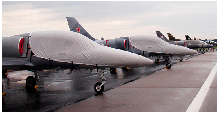
L-39 Canopy/Nose Covers & Plugs