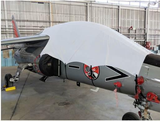
Dornier Alpha Jet Canopy Cover, test fit cover

This cover type is made from Silver Acrylic Sunbrella canvas and is 100% lined with a soft and smooth microfiber. Bruce's Custom Covers developed this material combination especially for aircraft protection. The outer material is medium weight and treated for water resistance, UV resistance and anti-static buildup. The inner lining is a very soft and smooth microfiber to prevent scratching. The material is very reflective, and tests show that the cabin interior temperature can be reduced to near-ambient temperature on the hottest of days. It is water, ice and snow repellent, yet breathable to allow moisture to escape from between the cover and the aircraft surface.