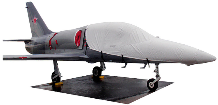
L-39 Canopy/Nose Cover & Plugs