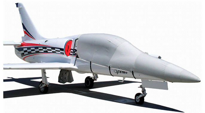
L39 Canopy/Nose Cover & Intake Plugs