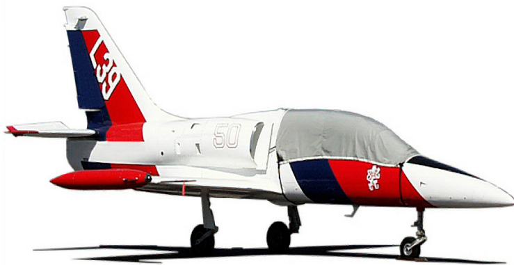
Canopy Cover for Aero L-39 Albatros

Travel Covers are made with Silver Solution-Dyed Polyester fabric and only lined over the windshield to save weight. The material is lightweight and more compact for easy stowage in the aircraft. The polyester material is water resistant, but only intended for occasional use outside. We also have an ultra lightweight material available for fitted hangar dust covers. For daily outdoor use, the non-travel Sunbrella Cover is the best choice.