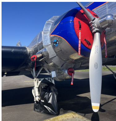
DC-3 Engine Plugs, Tire Covers

Engine Inlet Plugs are custom fit for your Douglas DC-3 intakes, made with heavy-duty vinyl material, and stuffed with a single block of sculpted urethane foam. Each plug has a zipper that allows the foam to be removed and dried if necessary. Engine plugs have warning flags that are visible from the cockpit or 'remove before flight' streamers sewn onto the face of the plugs. Most plugs are imprinted with the aircraft registration number in black for an extra charge. Storage bag NOT included. Engine plugs may be inserted after flight when the engine is still warm. Engine Inlet Plugs are commonly referred to as Cowl Plugs, Intake Plugs, Cowl Blocks, Engine Blocks, and Engine Bungs.