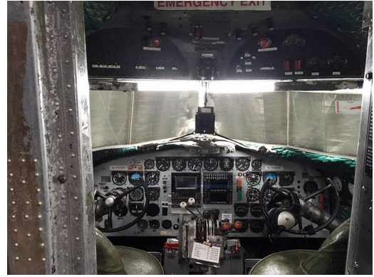
Douglas DC-3 Cockpit Heatshields