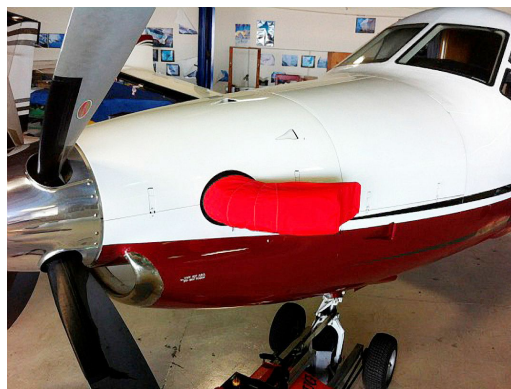
Pilatus PC-12 Exhaust Cover, Fully Enclosed, for protection against corrosion.