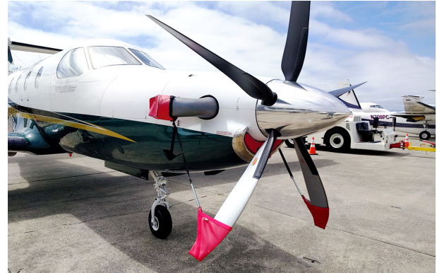
PC-12 Canopy Cover, Engine Plugs, Prop Tie/Exhaust Covers Main Intake Plug and Prop-Tie/Exhaust Covers. (Sold Separately)