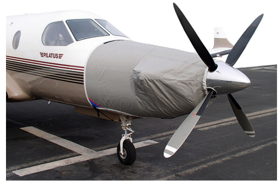
Pilatus PC-12 Engine Cover