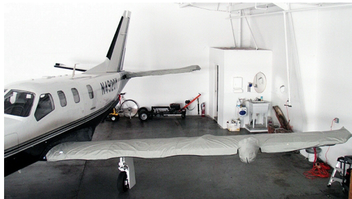
Pilatus PC-12 Wing Covers

WINTER USE MATERIAL - Made with Solution-Dyed Polyester fabric, this option is intended for seasonal use to aid in deicing, rain mitigation, or for occasional travel. The material is lighter and more compact, but more susceptible to UV damage and may have a shorter useful life if used continuously outside than the all-year use material.