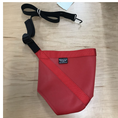
Prop Tie-Down, Various Models (secures with a hook to engine nacelle)