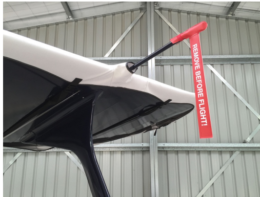
Beech Staggerwing Complete Cover Set, Upper Wing Detail

Howard DGA Models Pitot Tube Covers , NOT HEAT RESISTANT TYPE, are made of Naugahyde vinyl, and are designed to cover the entire pitot assembly. Slipping over the tube, the cover tightens around the base with a Velcro strap detail. A "Remove Before Flight" streamer is attached to the cover. Heat Resistant Pitot Covers are an upgrade to this design, and help prevent the pitot cover from melting onto the tube if the pitot heat is accidentally turned on while installed. If you want the set tethered together, please let us know.