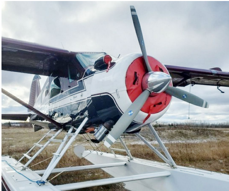
DeHavilland DH2 Beaver Engine Plugs

Engine Inlet Plugs are custom fit for your DeHavilland Beaver DHC-2, U-6A, U-6B intakes, made with heavy-duty vinyl material, and stuffed with a single block of sculpted urethane foam. Each plug has a zipper that allows the foam to be removed and dried if necessary. Engine plugs have warning flags that are visible from the cockpit or 'remove before flight' streamers sewn onto the face of the plugs. Most plugs are imprinted with the aircraft registration number in black for an extra charge. Storage bag NOT included. Engine plugs may be inserted after flight when the engine is still warm. Engine Inlet Plugs are commonly referred to as Cowl Plugs, Intake Plugs, Cowl Blocks, Engine Blocks, and Engine Bungs.