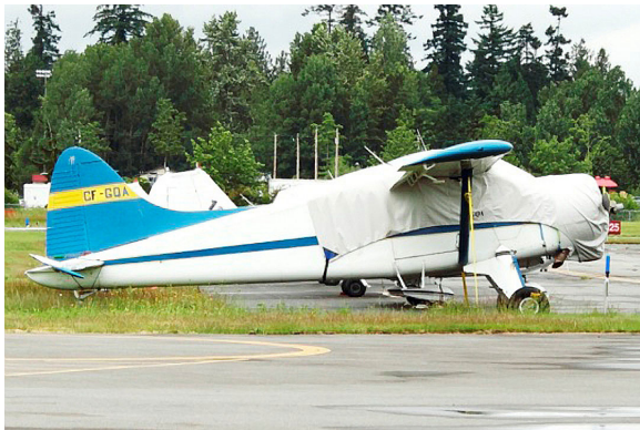
Beaver Canopy/Engine Cover

This cover type is made from Silver Acrylic Sunbrella canvas and is 100% lined with a soft and smooth microfiber. Bruce's Custom Covers developed this material combination especially for aircraft protection. The outer material is medium weight and treated for water resistance, UV resistance and anti-static buildup. The inner lining is a very soft and smooth microfiber to prevent scratching. The material is very reflective, and tests show that the cabin interior temperature can be reduced to near-ambient temperature on the hottest of days. It is water, ice and snow repellent, yet breathable to allow moisture to escape from between the cover and the aircraft surface.