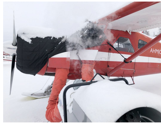
DeHavilland Beaver DHC-2, U-6A, U-6B Insulated Windshield/Engine Cover