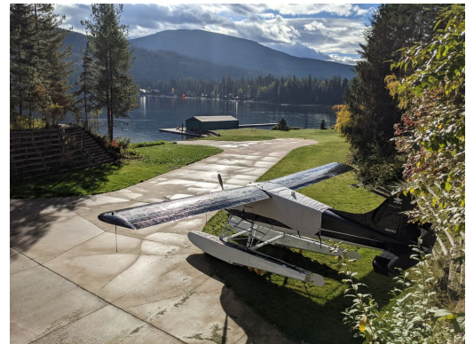
Beaver DHC2 MK1 Canopy/Engine Cover