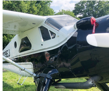
DeHavilland DH-2 Upper Cowling Air Scoop Plug