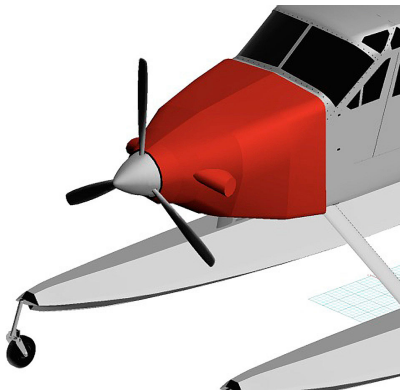
Turbo Beaver Insulated Engine Cover, 3D model

This cover type is made from Silver Acrylic Sunbrella canvas and is 100% lined with a soft and smooth microfiber. Bruce's Custom Covers developed this material combination especially for aircraft protection. The outer material is medium weight and treated for water resistance, UV resistance and anti-static buildup. The inner lining is a very soft and smooth microfiber to prevent scratching. The material is very reflective, and tests show that the cabin interior temperature can be reduced to near-ambient temperature on the hottest of days. It is water, ice and snow repellent, yet breathable to allow moisture to escape from between the cover and the aircraft surface.