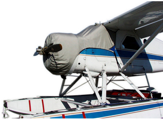
Beaver Windshield/Engine Cover

Travel Covers are made with Silver Solution-Dyed Polyester fabric and only lined over the windshield to save weight. The material is lightweight and more compact for easy stowage in the aircraft. The polyester material is water resistant, but only intended for occasional use outside. We also have an ultra lightweight material available for fitted hangar dust covers. For daily outdoor use, the non-travel Sunbrella Cover is the best choice.