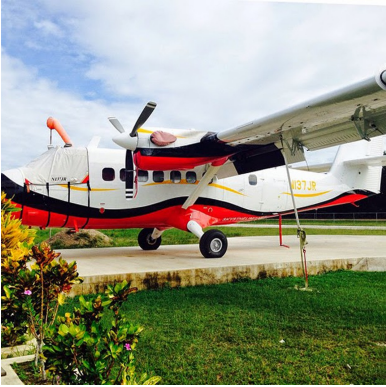
Twin Otter Cockpit Cover & Engine Plugs

water resistance, UV resistance and anti-static buildup. The inner lining is a very soft and smooth microfiber to prevent scratching. The material is very reflective, and tests show that the cabin interior temperature can be reduced to near-ambient temperature on the hottest of days. It is water, ice and snow repellent, yet breathable to allow moisture to escape from between the cover and the aircraft surface.