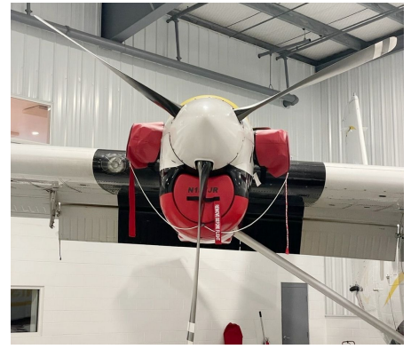
De Havilland Twin Otter Insulated Engine & Insulated Propellor/Spinner Covers DeHavilland DH-6 Intake Plugs, Exhaust Covers