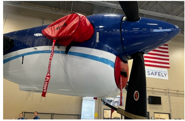
DeHavilland Twin Otter DHC6 Intake Plug, Exhaust Covers