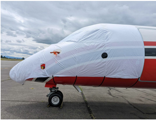
DeHavilland Dash 8, Q400 Cockpit/Nose Cover, test fit cover