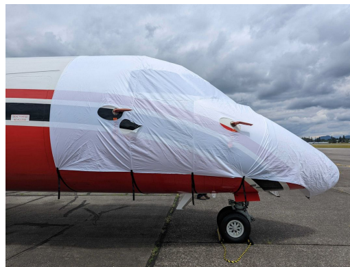
DeHavilland Dash 8, Q400 Cockpit/Nose Cover, test fit cover