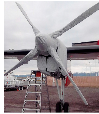
Dash 8 Insulated Engine & Prop Covers