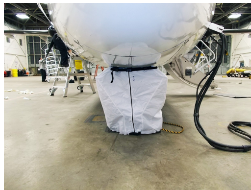
Q400, Nose gear landing/tire covers - Cold Weather Ops