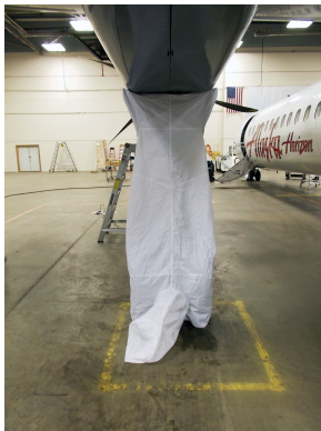
Q400, Main gear landing/tire covers - Cold Weather Ops

ALL-YEAR USE MATERIAL - Made with Silver Acrylic Sunbrella canvas, the all-year use material is the best option for sun protection and cover longevity. This heavier more durable material is intended for all weather conditions, such as rain and snow or lots of sun.