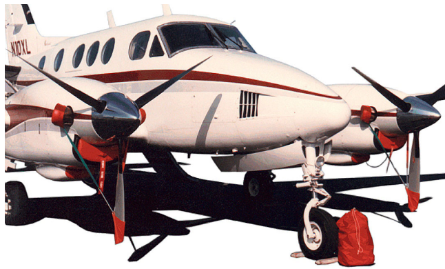
Pitot, Exhaust Covers, Engine Plugs & Prop Ties