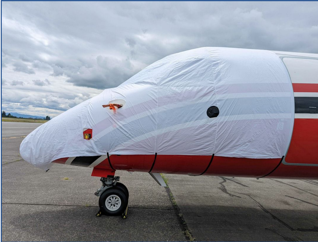
DeHavilland Dash 8, Q400 Cockpit/Nose Cover, test fit cover