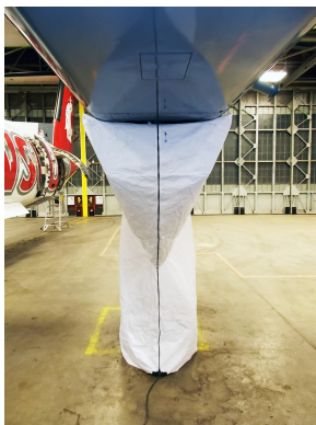
Q400, Main gear landing/tire covers - Cold Weather Ops

ALL-YEAR USE MATERIAL - Made with Silver Acrylic Sunbrella canvas, the all-year use material is the best option for sun protection and cover longevity. This heavier more durable material is intended for all weather conditions, such as rain and snow or lots of sun.