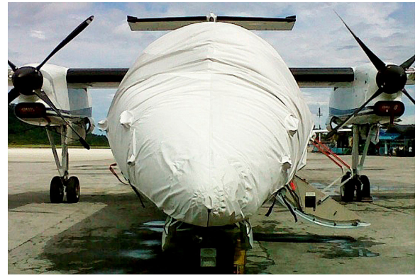
De Havilland Dash 8 Cockpit/Nose Cover