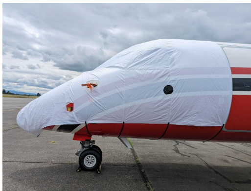
DeHavilland Dash 8, Q400 Cockpit/Nose Cover, test fit cover