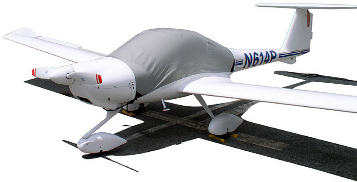
Diamond DA-20 Canopy Cover