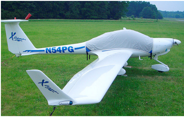
Dimona Xtreme Canopy Cover