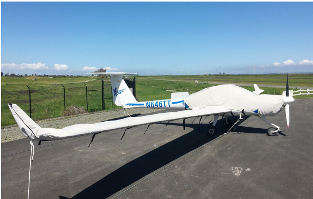
Dimona/Diamond HK36 Extreme Canopy/Engine, Wing Covers

WINTER USE MATERIAL - Made with Solution-Dyed Polyester fabric, this option is intended for seasonal use to aid in deicing, rain mitigation, or for occasional travel. The material is lighter and more compact, but more susceptible to UV damage and may have a shorter useful life if used continuously outside than the all-year use material.