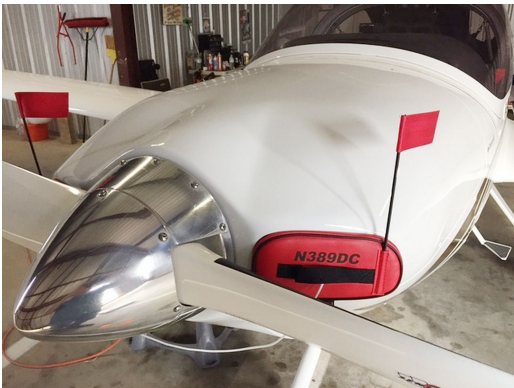
DA-20 Canopy/Engine, Prop/Spinner, Wing, Tailboom, Horiz. Stab. Covers