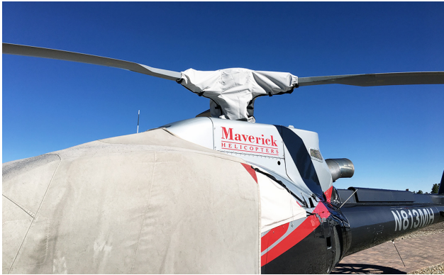
Eurocopter EC-130 Main Rotor Hub Cover

tight at the blade root with straps and quick-release plastic buckles. The Cold Weather Blade Covers are fitted with full-length zippers and optional deice “boots” designed to accept a preheater hose; a small opening at the tip of the cover allows for some air circulation and drainage in freezing weather. Some part numbers have features for an extra charge.