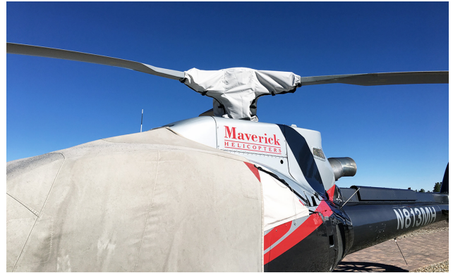
Eurocopter EC-130 Main Rotor Hub Cover