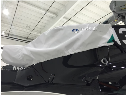
EC-130 Engine Area/Exhaust Cover

tight at the blade root with straps and quick-release plastic buckles. The Cold Weather Blade Covers are fitted with full-length zippers and optional deice “boots” designed to accept a preheater hose; a small opening at the tip of the cover allows for some air circulation and drainage in freezing weather. Some part numbers have features for an extra charge.