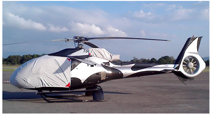
Bubble Cover and Intake/Exhaust Cover