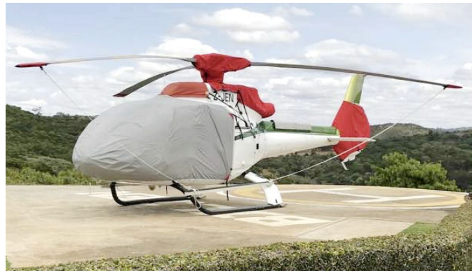
EC130 Bubble, Intake, Exhaust, Rotor Hub & Tailfan Covers