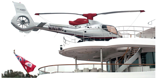
Intake/Exhaust Cover, Rotor Hub Cover (w/ skirt) & Blade Tie Downs