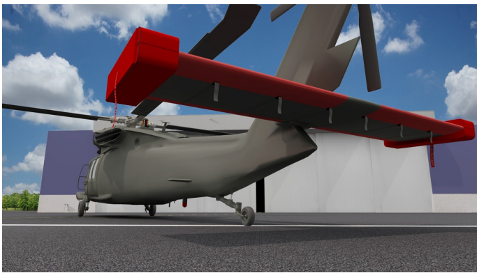
Padded Horizontal Stab Covers, Wingtip Pads (illustration)