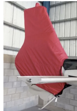
Eurocopter EC-130 Tailfan/Upper Vert Stab Housing Cover