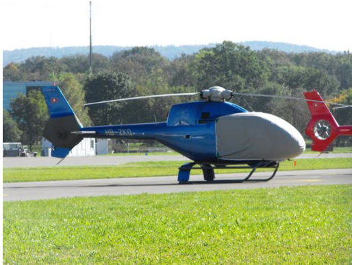
EC-130 Bubble, Tailfan, and Rotor Hub Cover

This cover type is made from Silver Acrylic Sunbrella canvas and is 100% lined with a soft and smooth microfiber. Bruce's Custom Covers developed this material combination especially for aircraft protection. The outer material is medium weight and treated for water resistance, UV resistance and anti-static buildup. The inner lining is a very soft and smooth microfiber to prevent scratching. The material is very reflective, and tests show that the cabin interior temperature can be reduced to near-ambient temperature on the hottest of days. It is water, ice and snow repellent, yet breathable to allow moisture to escape from between the cover and the aircraft surface.