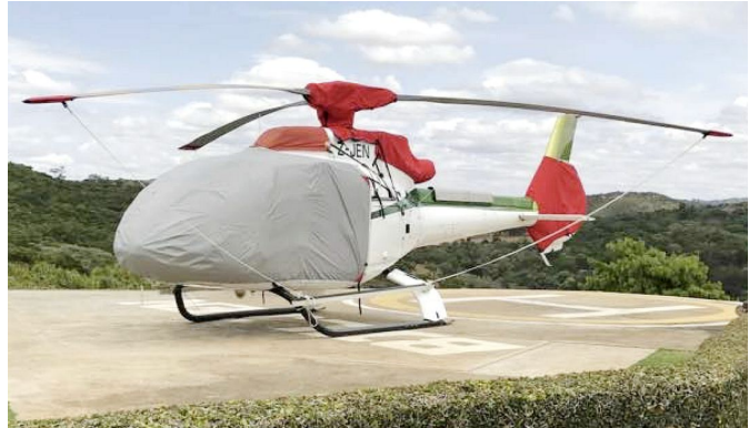
EC130 Bubble, Intake, Exhaust, Rotor Hub & Tailfan Covers