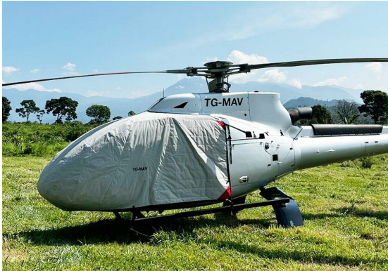
Airbus H-130 Insulated Bubble Cover

This cover type is made from Silver Acrylic Sunbrella canvas and is 100% lined with a soft and smooth microfiber. Bruce's Custom Covers developed this material combination especially for aircraft protection. The outer material is medium weight and treated for water resistance, UV resistance and anti-static buildup. The inner lining is a very soft and smooth microfiber to prevent scratching. The material is very reflective, and tests show that the cabin interior temperature can be reduced to near-ambient temperature on the hottest of days. It is water, ice and snow repellent, yet breathable to allow moisture to escape from between the cover and the aircraft surface.