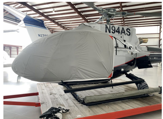
Airbus H-130 Bubble Cover, Travel Weight