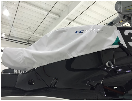
EC-130 Engine Area/Exhaust Cover