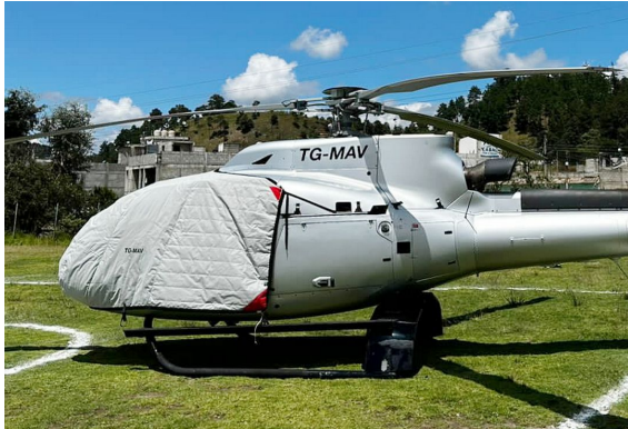
Airbus H-130 Insulated Bubble Cover

This cover type is made from Silver Acrylic Sunbrella canvas and is 100% lined with a soft and smooth microfiber. Bruce's Custom Covers developed this material combination especially for aircraft protection. The outer material is medium weight and treated for water resistance, UV resistance and anti-static buildup. The inner lining is a very soft and smooth microfiber to prevent scratching. The material is very reflective, and tests show that the cabin interior temperature can be reduced to near-ambient temperature on the hottest of days. It is water, ice and snow repellent, yet breathable to allow moisture to escape from between the cover and the aircraft surface.