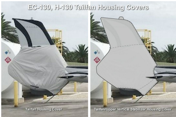
Airbus Helicopter H-130 Tailfan Housing Covers

The Tailboom Cover details vary by model, but generally the helicopter tail boom cover encloses the tail boom from the "bottleneck" to the aft end. They usually also cover the horizontal stabilizers, and are custom made to allow for antennae, lights, and other protrusions. They attach with straps underneath the tail boom. Covers for the vertical and horizontal stabilizers are also available separately. Specific information for each model is available on request.