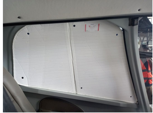
Airbus Helicopter EC130 B4 Side Window Heatshields