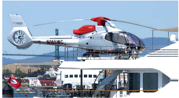
Intake/Exhaust Cover & Rotor Hub Cover (w/ skirt)