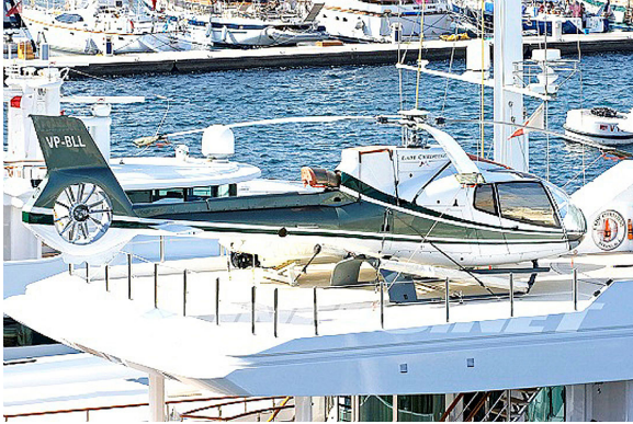
EC-130 Front, Side and Skylight Window HeatShields

Heatshields are interior sunshades for an aircraft's windows or canopy glass. The product is a unique composite of closed-cell foam with a silver mylar finish. The semi-rigid design is stiff enough to stand along the inside of the windshield using sun visors or window framing. It folds up flat and easily stores in the included storage sleeve. Some designs may require velcro and suction cups. A Heatshield is an excellent short-term remedy for cockpit overheating.