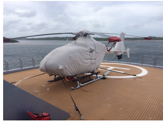
Eurocopter EC-135 Full Body Covers