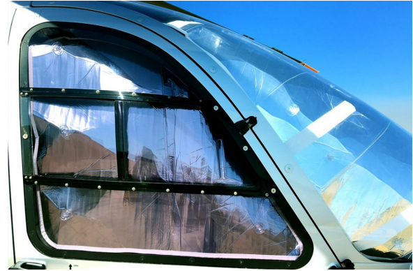
Airbus EC-135 Cockpit HeatShields