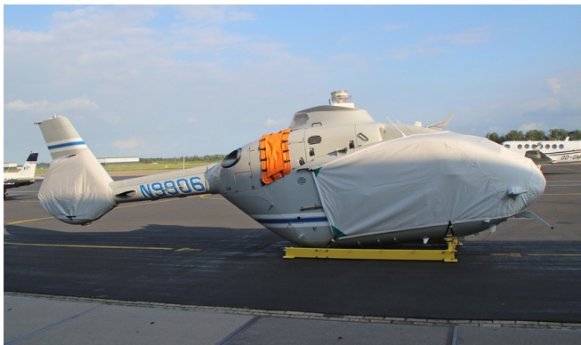
Eurocopter EC-135 Bubble & Tailfan Covers

The Tailboom Cover details vary by model, but generally the helicopter tail boom cover encloses the tail boom from the "bottleneck" to the aft end. They usually also cover the horizontal stabilizers, and are custom made to allow for antennae, lights, and other protrusions. They attach with straps underneath the tail boom. Covers for the vertical and horizontal stabilizers are also available separately. Specific information for each model is available on request.