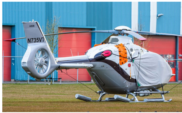
Airbus EC135T3 Blade Tie-Downs