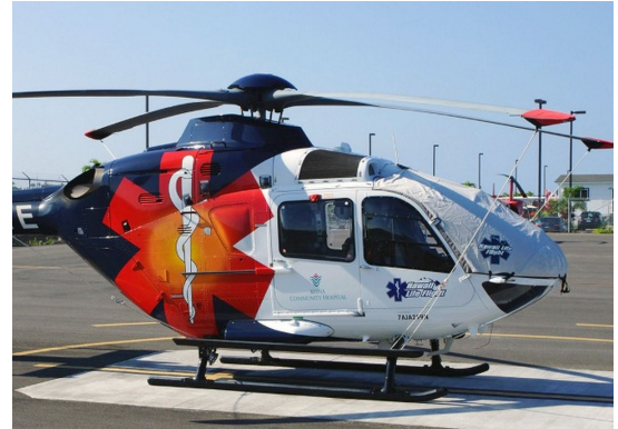
Eurocopter EC-135 Windshield/Skylight Cover