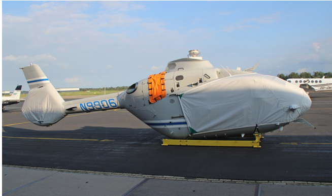
Eurocopter EC-135 Bubble & Tailfan Covers

This cover type is made from Silver Acrylic Sunbrella canvas and is 100% lined with a soft and smooth microfiber. Bruce's Custom Covers developed this material combination especially for aircraft protection. The outer material is medium weight and treated for water resistance, UV resistance and anti-static buildup. The inner lining is a very soft and smooth microfiber to prevent scratching. The material is very reflective, and tests show that the cabin interior temperature can be reduced to near-ambient temperature on the hottest of days. It is water, ice and snow repellent, yet breathable to allow moisture to escape from between the cover and the aircraft surface.