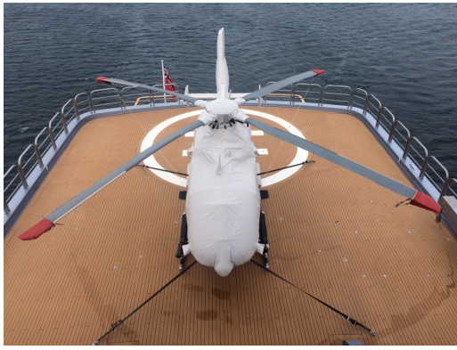
Eurocopter EC-135 Full Body Covers