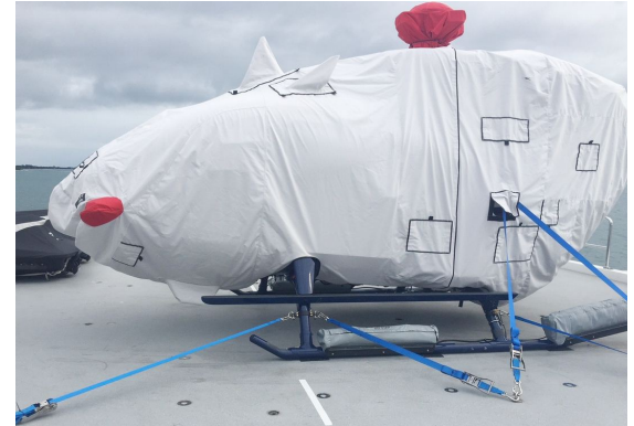
Eurocopter EC-145 D2 Main Body Cover