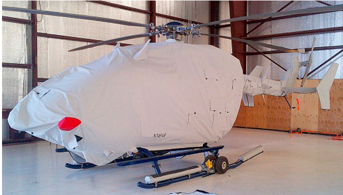
Main Body (also covers bottom), Tailboom, Vertical Pylon, Stabilizers and Tail Rotor Covers

This cover type is made from Silver Acrylic Sunbrella canvas and is 100% lined with a soft and smooth microfiber. Bruce's Custom Covers developed this material combination especially for aircraft protection. The outer material is medium weight and treated for water resistance, UV resistance and anti-static buildup. The inner lining is a very soft and smooth microfiber to prevent scratching. The material is very reflective, and tests show that the cabin interior temperature can be reduced to near-ambient temperature on the hottest of days. It is water, ice and snow repellent, yet breathable to allow moisture to escape from between the cover and the aircraft surface.