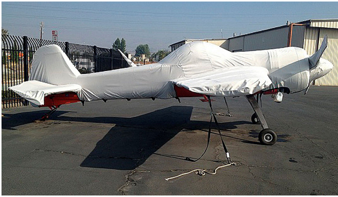
Yak 55 Full Fuselage Cover w/ Detachable Wing Covers & Propellor/Spinner Cover