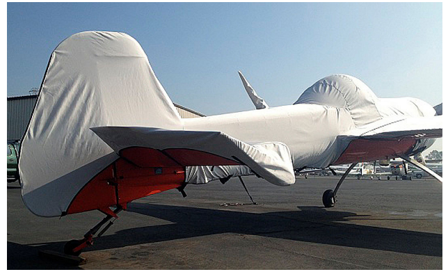
Yak 55 Full Fuselage Cover w/ Detachable Wing Covers & Propellor/Spinner Cover