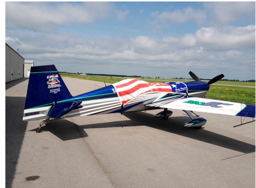
Extra 300SC Canopy Cover with custom artwork