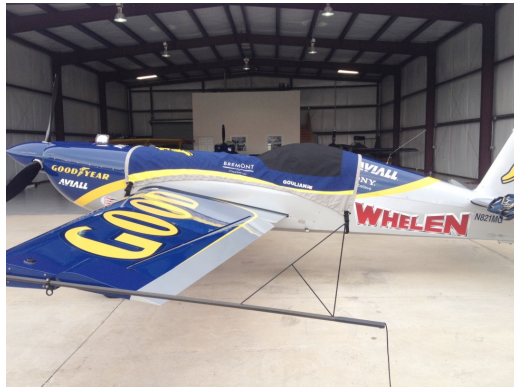
Extra 300SC with NASCAR style custom cover

Travel Covers are made with Silver Solution-Dyed Polyester fabric and only lined over the windshield to save weight. The material is lightweight and more compact for easy stowage in the aircraft. The polyester material is water resistant, but only intended for occasional use outside. We also have an ultra lightweight material available for fitted hangar dust covers. For daily outdoor use, the non-travel Sunbrella Cover is the best choice.