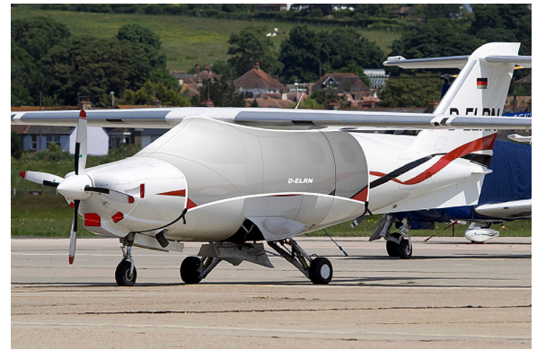
Covers, Plugs & HeatShields for the Extra 400