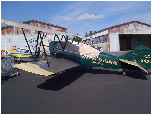
Travelair 4000 Canopy and Engine Cover

This cover type is made from Silver Acrylic Sunbrella canvas and is 100% lined with a soft and smooth microfiber. Bruce's Custom Covers developed this material combination especially for aircraft protection. The outer material is medium weight and treated for water resistance, UV resistance and anti-static buildup. The inner lining is a very soft and smooth microfiber to prevent scratching. The material is very reflective, and tests show that the cabin interior temperature can be reduced to near-ambient temperature on the hottest of days. It is water, ice and snow repellent, yet breathable to allow moisture to escape from between the cover and the aircraft surface.