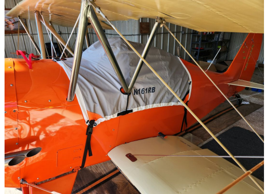
Burt Special Canopy Cover