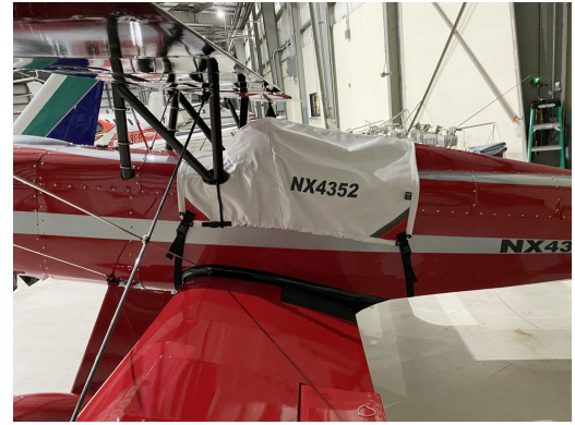
EAA Acro Sport Canopy Cover