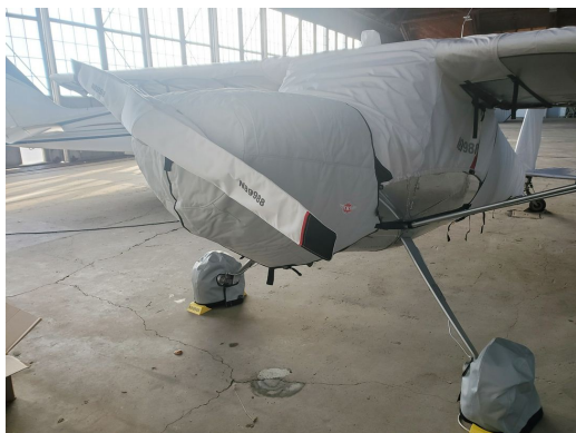
Cessna 140 Canopy, Wings, Prop, Tires & Empennage Covers

WINTER USE MATERIAL - Made with Solution-Dyed Polyester fabric, this option is intended for seasonal use to aid in deicing, rain mitigation, or for occasional travel. The material is lighter and more compact, but more susceptible to UV damage and may have a shorter useful life if used continuously outside than the all-year use material.