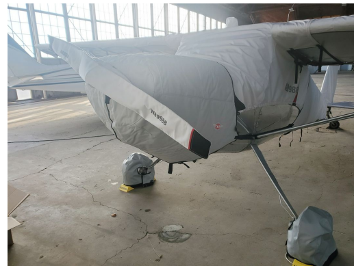
Cessna 140 Canopy, Wings, Prop, Tires & Empennage Covers