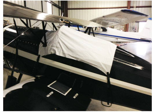
Rose Parrakeet Canopy Cover (test fit cover)