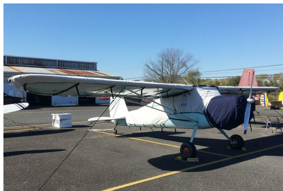
Cessna 140 Insulated Engine, Canopy, Empennage & Wing Covers