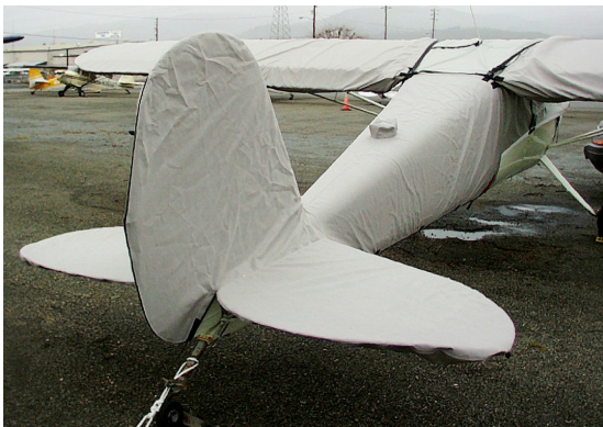
Cessna 120 Empennage Cover

WINTER USE MATERIAL - Made with Solution-Dyed Polyester fabric, this option is intended for seasonal use to aid in deicing, rain mitigation, or for occasional travel. The material is lighter and more compact, but more susceptible to UV damage and may have a shorter useful life if used continuously outside than the all-year use material.