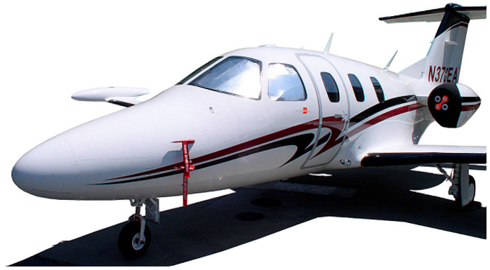
Cockpit HeatShields, Pitot Covers & "Bikini" style Engine Covers