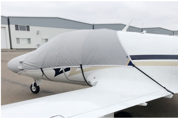
Customized to end before main antenna, with easy to use flat-hook straps.

This cover type is made from Silver Acrylic Sunbrella canvas and is 100% lined with a soft and smooth microfiber. Bruce's Custom Covers developed this material combination especially for aircraft protection. The outer material is medium weight and treated for water resistance, UV resistance and anti-static buildup. The inner lining is a very soft and smooth microfiber to prevent scratching. The material is very reflective, and tests show that the cabin interior temperature can be reduced to near-ambient temperature on the hottest of days. It is water, ice and snow repellent, yet breathable to allow moisture to escape from between the cover and the aircraft surface.