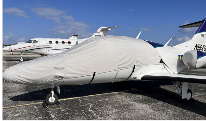
Eclipse EA500 Canopy/Nose Cover