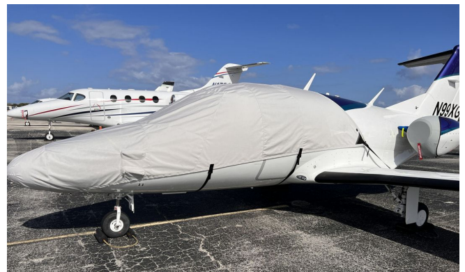
Eclipse EA500 Canopy/Nose Cover