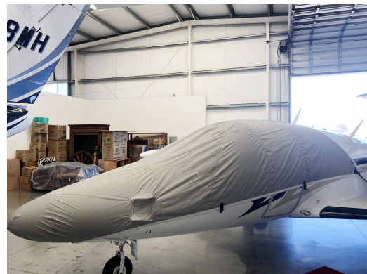
Eclipse EA500 Travel Weight Canopy/Nose Cover