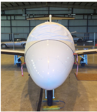
Eclipse Cockpit Door Cover, with Pitot Tube Covers

This cover type is made from Silver Acrylic Sunbrella canvas and is 100% lined with a soft and smooth microfiber. Bruce's Custom Covers developed this material combination especially for aircraft protection. The outer material is medium weight and treated for water resistance, UV resistance and anti-static buildup. The inner lining is a very soft and smooth microfiber to prevent scratching. The material is very reflective, and tests show that the cabin interior temperature can be reduced to near-ambient temperature on the hottest of days. It is water, ice and snow repellent, yet breathable to allow moisture to escape from between the cover and the aircraft surface.