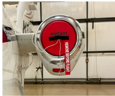
Eclipse EA500 Intake/Exhaust Plugs