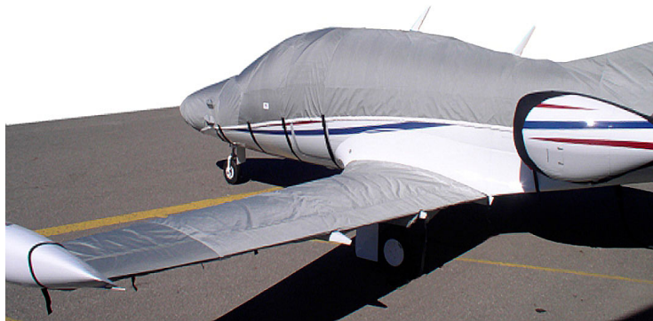
Fuselage Cover & Wing Covers with hail protection on all upper surfaces

WINTER USE MATERIAL - Made with Solution-Dyed Polyester fabric, this option is intended for seasonal use to aid in deicing, rain mitigation, or for occasional travel. The material is lighter and more compact, but more susceptible to UV damage and may have a shorter useful life if used continuously outside than the all-year use material.