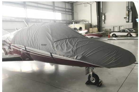
Eclipse Light Weight Travel Cover & Engine Plugs