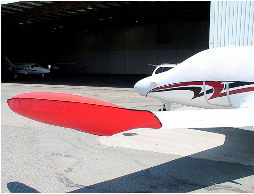
Eclipse Tip Tank Cover

Designed to prevent damage to the aircraft extremities in crowded hangars, these products are made of bright red Naugahyde and thickly padded with a sandwich of closed cell foam.