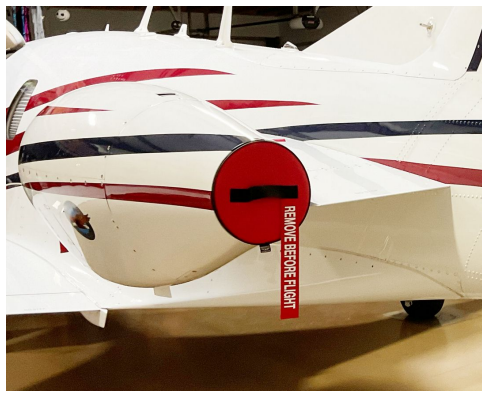
Eclipse EA500 Intake/Exhaust Plugs