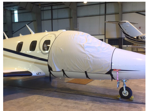
Eclipse Cockpit Door Cover, with Pitot Tube Covers