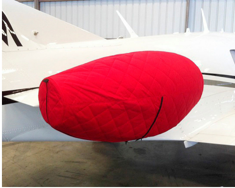
Eclipse Insulated Engine Cover

The Eclipse EA500, TE500, 550 Bikini Style Engine Covers are a single-piece design using a soft and smooth stretchy and fabric. The cover stretches tightly over both the intake and exhaust, installing quickly and easily. These covers are designed to be used as hangar dust covers and have a useful life of approximately one year.