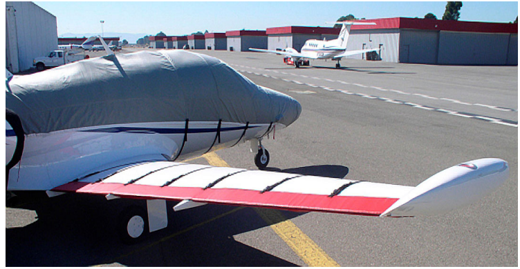
Fuselage Cover with Hail Protection & Wing Control Surfaces Hail Protection Pads