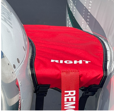
Eclipse EA500, TE500, 550 Pylon Covers

The Eclipse EA500, TE500, 550 Bikini Style Engine Covers are a single-piece design using a soft and smooth stretchy fabric. The cover stretches tightly over both the intake and exhaust, installing quickly and easily. These covers are designed to be used as hangar dust covers and have a useful life of approximately one year.