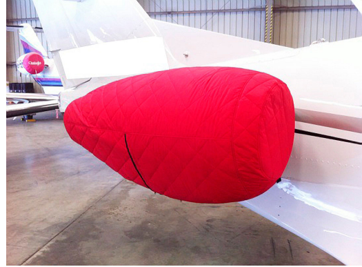
Eclipse Insulated Engine Cover