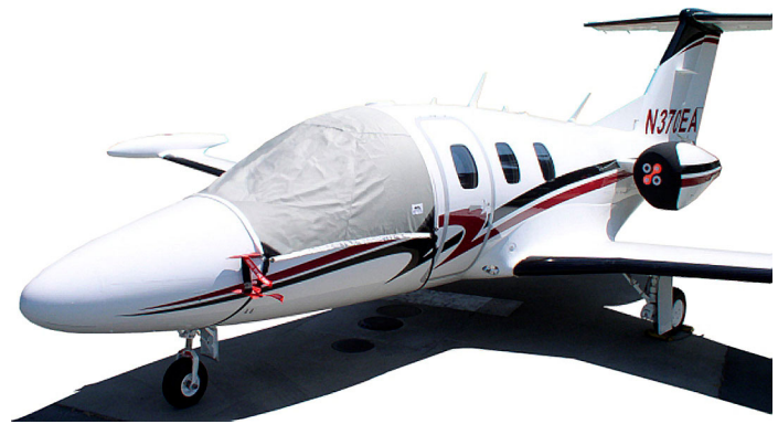
Eclipse Windshield Cover, Pitot Covers & "Bikini" style Engine Covers