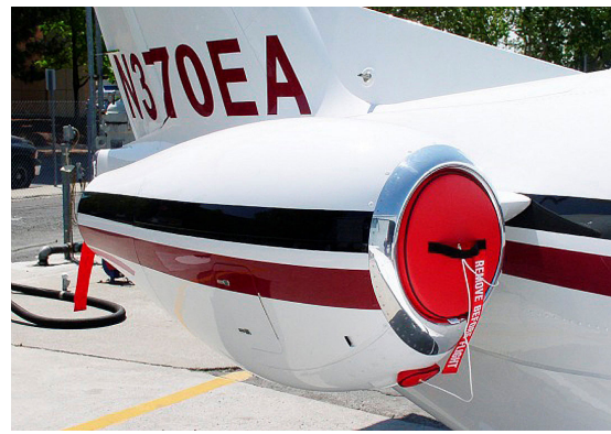
Eclipse Engine Inlet Plugs set