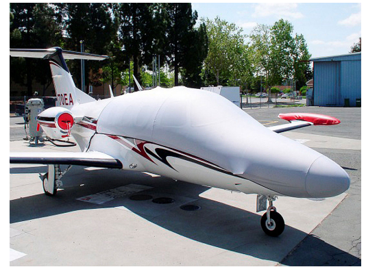
Eclipse Light Weight Travel Cover & Engine Plugs