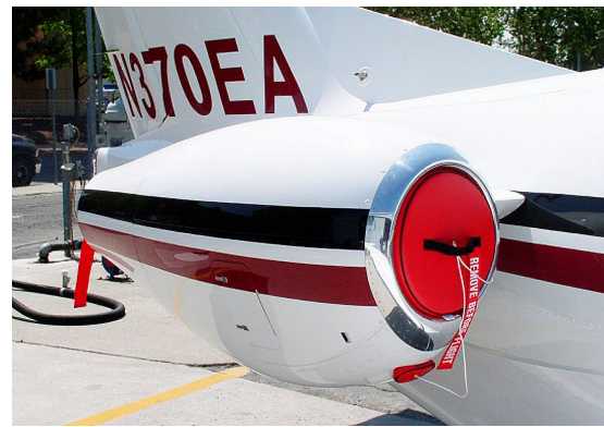
Eclipse Engine Inlet Plugs set