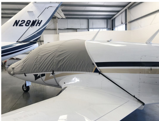
Eclipse EA500 Travel Weight Canopy/Nose Cover

This cover type is made from Silver Acrylic Sunbrella canvas and is 100% lined with a soft and smooth microfiber. Bruce's Custom Covers developed this material combination especially for aircraft protection. The outer material is medium weight and treated for water resistance, UV resistance and anti-static buildup. The inner lining is a very soft and smooth microfiber to prevent scratching. The material is very reflective, and tests show that the cabin interior temperature can be reduced to near-ambient temperature on the hottest of days. It is water, ice and snow repellent, yet breathable to allow moisture to escape from between the cover and the aircraft surface.