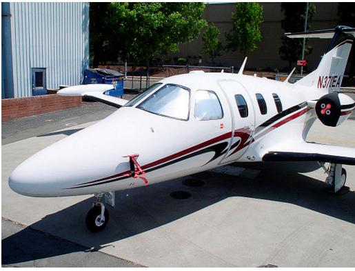
Eclipse Pitot Cover & Bikini Type Engine Covers