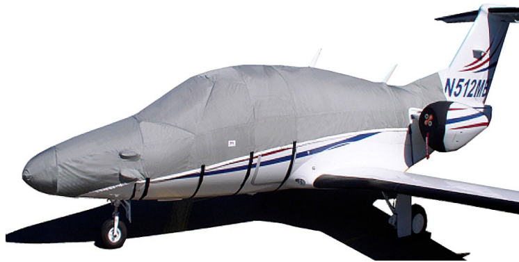
Fuselage Cover, hail protection on all upper surfaces

This cover type is made from Silver Acrylic Sunbrella canvas and is 100% lined with a soft and smooth microfiber. Bruce's Custom Covers developed this material combination especially for aircraft protection. The outer material is medium weight and treated for water resistance, UV resistance and anti-static buildup. The inner lining is a very soft and smooth microfiber to prevent scratching. The material is very reflective, and tests show that the cabin interior temperature can be reduced to near-ambient temperature on the hottest of days. It is water, ice and snow repellent, yet breathable to allow moisture to escape from between the cover and the aircraft surface.