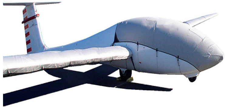
Sailplane Full Cover Set Graphic Indicators (Discus 2B, 3D model)