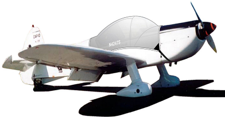
Mudry CAP 10 Canopy Cover (Illustration)

Travel Covers are made with Silver Solution-Dyed Polyester fabric and only lined over the windshield to save weight. The material is lightweight and more compact for easy stowage in the aircraft. The polyester material is water resistant, but only intended for occasional use outside. We also have an ultra lightweight material available for fitted hangar dust covers. For daily outdoor use, the non-travel Sunbrella Cover is the best choice.