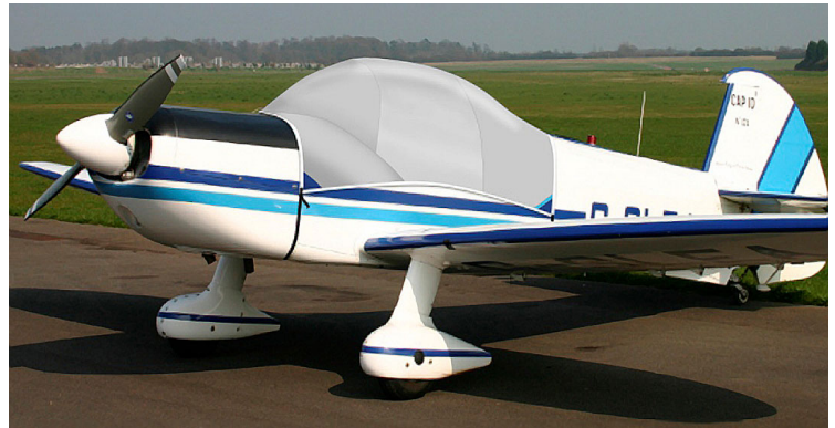
Mudry CAP 10 Canopy Cover (Illustration)