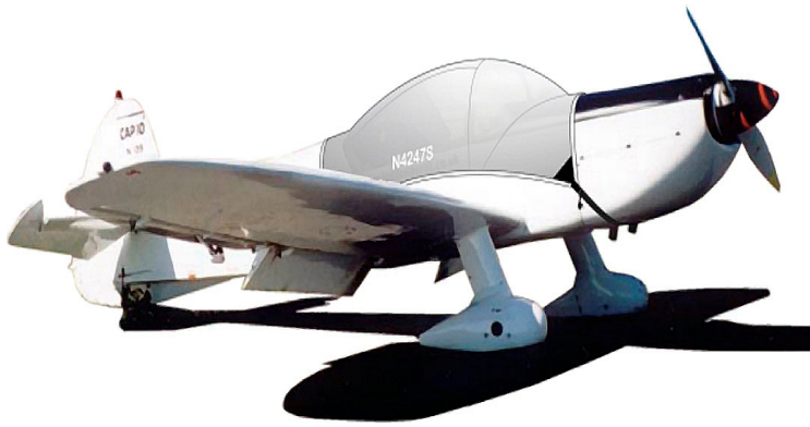
Mudry CAP 10 Canopy Cover (Illustration)

the hottest of days. It is water, ice and snow repellent, yet breathable to allow moisture to escape from between the cover and the aircraft surface.