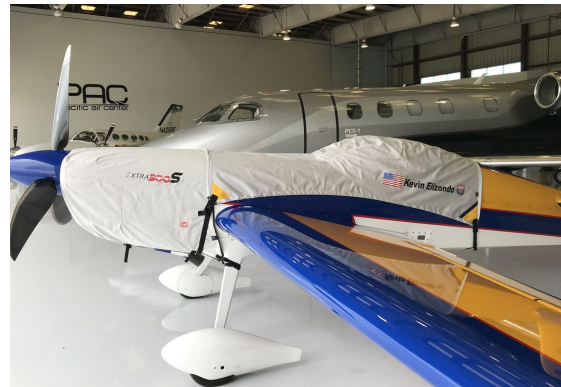
Extra 300S Canopy & Engine Covers