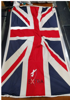
Custom Full-Cover Artwork

This cover type is made from Silver Acrylic Sunbrella canvas and is 100% lined with a soft and smooth microfiber. Bruce's Custom Covers developed this material combination especially for aircraft protection. The outer material is medium weight and treated for water resistance, UV resistance and anti-static buildup. The inner lining is a very soft and smooth microfiber to prevent scratching. The material is very reflective, and tests show that the cabin interior temperature can be reduced to near-ambient temperature on the hottest of days. It is water, ice and snow repellent, yet breathable to allow moisture to escape from between the cover and the aircraft surface.