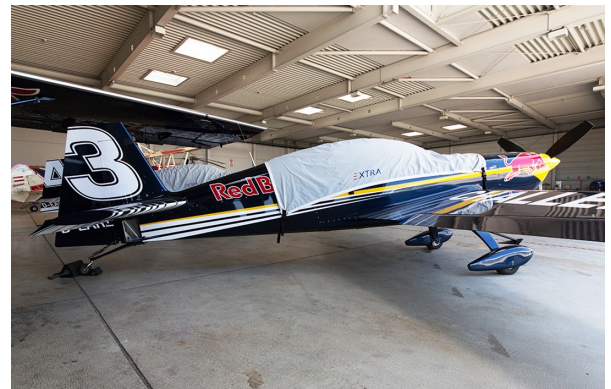
Extra 300L Canopy Cover