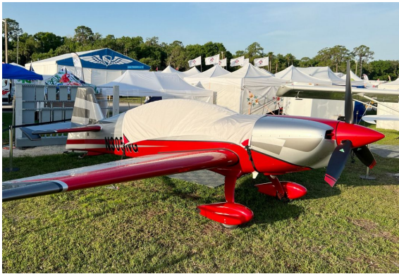
Extra NG Canopy Cover

This cover type is made from Silver Acrylic Sunbrella canvas and is 100% lined with a soft and smooth microfiber. Bruce's Custom Covers developed this material combination especially for aircraft protection. The outer material is medium weight and treated for water resistance, UV resistance and anti-static buildup. The inner lining is a very soft and smooth microfiber to prevent scratching. The material is very reflective, and tests show that the cabin interior temperature can be reduced to near-ambient temperature on the hottest of days. It is water, ice and snow repellent, yet breathable to allow moisture to escape from between the cover and the aircraft surface.