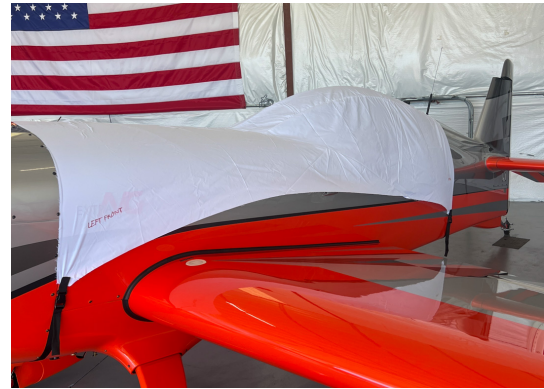
Extra NG Canopy Cover, Single Place Model, test fit cover