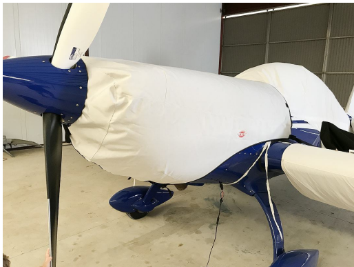
Extra 300, 330SC & 200/230 Models Engine Cover

This cover type is made from Silver Acrylic Sunbrella canvas and is 100% lined with a soft and smooth microfiber. Bruce's Custom Covers developed this material combination especially for aircraft protection. The outer material is medium weight and treated for water resistance, UV resistance and anti-static buildup. The inner lining is a very soft and smooth microfiber to prevent scratching. The material is very reflective, and tests show that the cabin interior temperature can be reduced to near-ambient temperature on the hottest of days. It is water, ice and snow repellent, yet breathable to allow moisture to escape from between the cover and the aircraft surface.