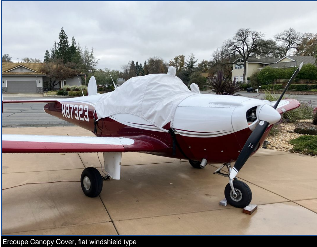
Ercoupe Canopy Cover, flat windshield type