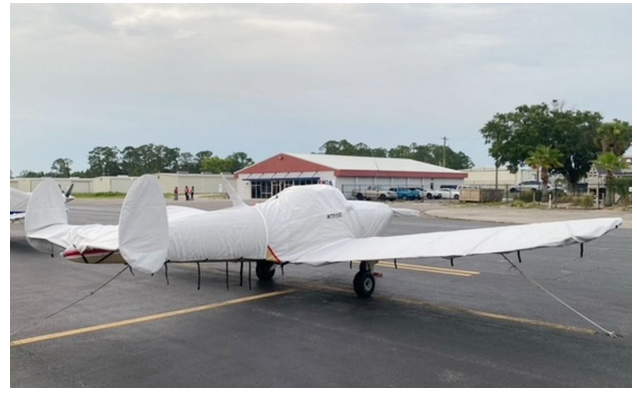
Ercoupe Complete Cover Set