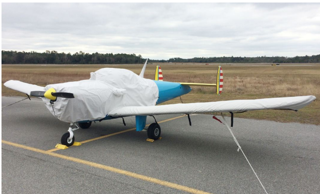
Ercoupe Extended Canopy/Engine Cover, and Wing Covers

WINTER USE MATERIAL - Made with Solution-Dyed Polyester fabric, this option is intended for seasonal use to aid in deicing, rain mitigation, or for occasional travel. The material is lighter and more compact, but more susceptible to UV damage and may have a shorter useful life if used continuously outside than the all-year use material.