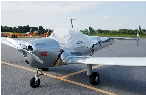
1946 Ercoupe 415-C Flat Windshield Canopy Cover

This cover type is made from Silver Acrylic Sunbrella canvas and is 100% lined with a soft and smooth microfiber. Bruce's Custom Covers developed this material combination especially for aircraft protection. The outer material is medium weight and treated for water resistance, UV resistance and anti-static buildup. The inner lining is a very soft and smooth microfiber to prevent scratching. The material is very reflective, and tests show that the cabin interior temperature can be reduced to near-ambient temperature on the hottest of days. It is water, ice and snow repellent, yet breathable to allow moisture to escape from between the cover and the aircraft surface.