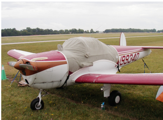
Ercoupe Canopy Cover, bubble windshield model

This cover type is made from Silver Acrylic Sunbrella canvas and is 100% lined with a soft and smooth microfiber. Bruce's Custom Covers developed this material combination especially for aircraft protection. The outer material is medium weight and treated for water resistance, UV resistance and anti-static buildup. The inner lining is a very soft and smooth microfiber to prevent scratching. The material is very reflective, and tests show that the cabin interior temperature can be reduced to near-ambient temperature on the hottest of days. It is water, ice and snow repellent, yet breathable to allow moisture to escape from between the cover and the aircraft surface.