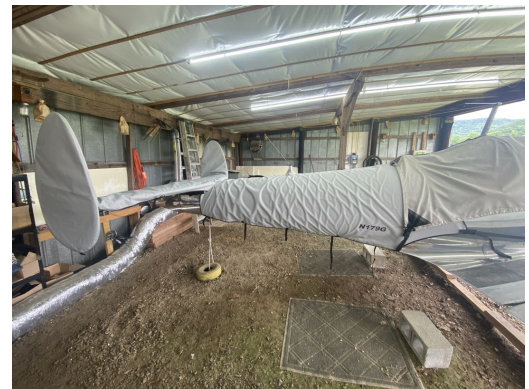
Ercoupe Empennage Cover