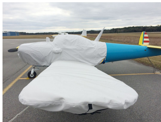
Ercoupe Extended Canopy/Engine Cover, and Wing Covers