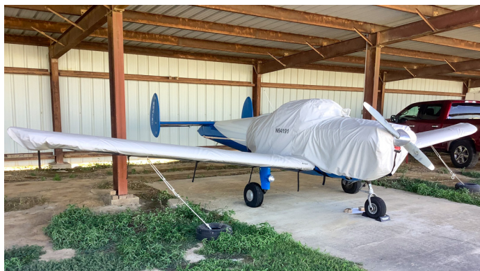
Ercoupe 415-C Wing Covers, All Year Use(set of 2)

WINTER USE MATERIAL - Made with Solution-Dyed Polyester fabric, this option is intended for seasonal use to aid in deicing, rain mitigation, or for occasional travel. The material is lighter and more compact, but more susceptible to UV damage and may have a shorter useful life if used continuously outside than the all-year use material.