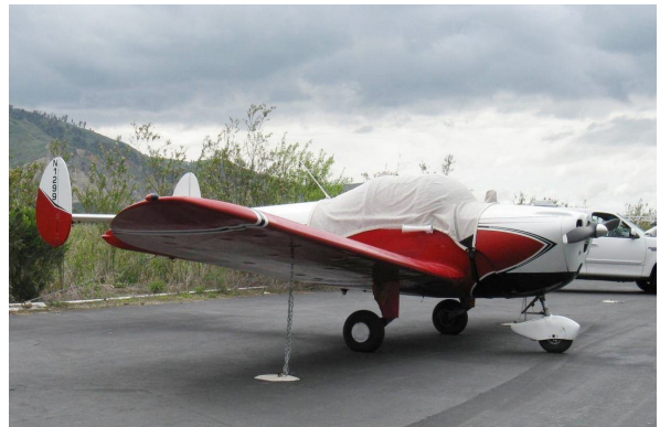
Ercoupe Canopy Cover