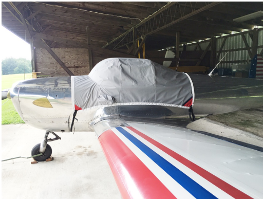
Ercoupe Light Weight Travel Cover

Travel Covers are made with Silver Solution-Dyed Polyester fabric and only lined over the windshield to save weight. The material is lightweight and more compact for easy stowage in the aircraft. The polyester material is water resistant, but only intended for occasional use outside. We also have an ultra lightweight material available for fitted hangar dust covers. For daily outdoor use, the non-travel Sunbrella Cover is the best choice.