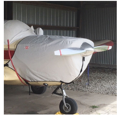
Ercoupe Engine Cover