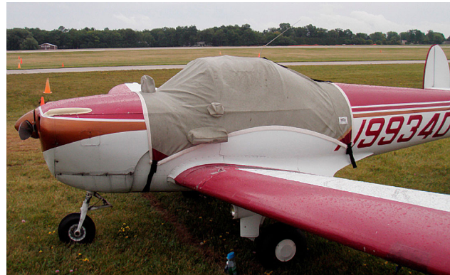
Ercoupe Canopy Cover, flat windshield model