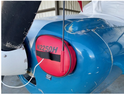
Ercoupe Engine Plugs