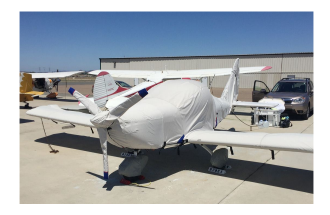
2017 Evector Sportstar Max All Year Use Wing Covers