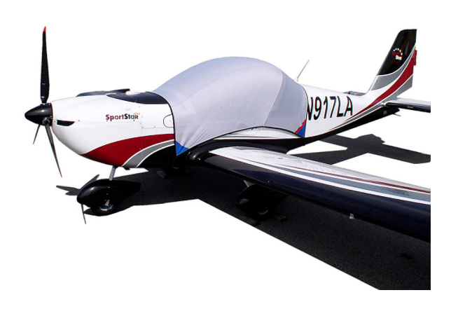
Evektor Sportstar Light Weight Travel-Cover