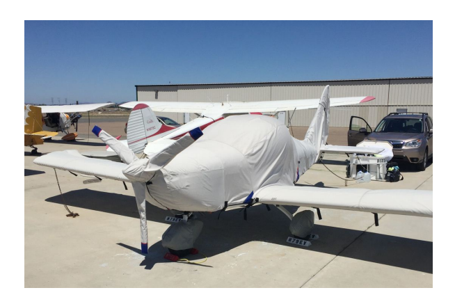
2017 Evector Sportstar Max All Year Use Wing Covers

shorter useful life if used continuously outside than the all-year use material.