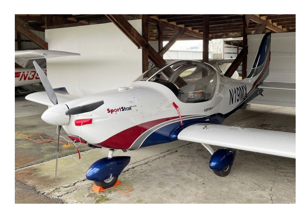
Evektor SportStar Engine & Vent Plugs

Engine Inlet Plugs are custom fit for your Evektor-Aerotechnik SportStar, Eurostar, Max, Harmony intakes, made with heavy-duty vinyl material, and stuffed with a single block of sculpted urethane foam. Each plug has a zipper that allows the foam to be removed and dried if necessary. Engine plugs have warning flags that are visible from the cockpit or 'remove before flight' streamers sewn onto the face of the plugs. Most plugs are imprinted with the aircraft registration number in black for an extra charge. Storage bag NOT included. Engine plugs may be inserted after flight when the engine is still warm. Engine Inlet Plugs are commonly referred to as Cowl Plugs, Intake Plugs, Cowl Blocks, Engine Blocks, and Engine Bungs.