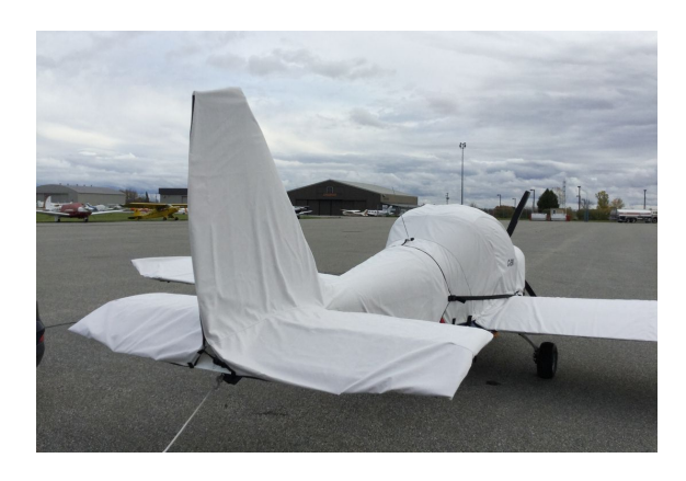
Evektor Sportstar Full Cover Set