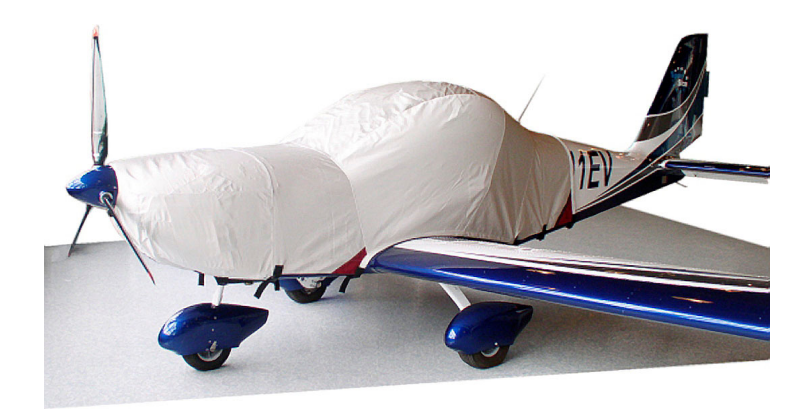
Evektor Sportstar Extended Canopy/Engine Cover