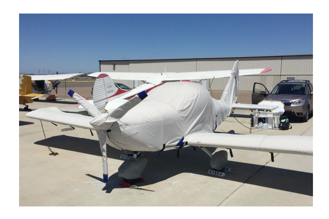
2017 Evector Sportstar Max All Year Use Wing Covers

This cover type is made from Silver Acrylic Sunbrella canvas and is 100% lined with a soft and smooth microfiber. Bruce's Custom Covers developed this material combination especially for aircraft protection. The outer material is medium weight and treated for water resistance, UV resistance and anti-static buildup. The inner lining is a very soft and smooth microfiber to prevent scratching. The material is very reflective, and tests show that the cabin interior temperature can be reduced to near-ambient temperature on the hottest of days. It is water, ice and snow repellent, yet breathable to allow moisture to escape from between the cover and the aircraft surface.