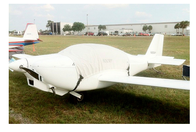
Europa XS Canopy Cover

The Europa All Europa Models Canopy/Engine Cover is a one-piece cover (100% lined with microfiber) that is a combination of the Canopy Cover and Engine Cover. This cover will enclose the engine cowl and will extend aft to cover all of the windows. This cover type is made from Silver Acrylic Sunbrella canvas and is 100% lined with a soft and smooth microfiber. Bruce's Custom Covers developed this material combination especially for aircraft protection. The outer material is medium weight and treated for water resistance, UV resistance and anti-static buildup. The inner lining is a very soft and smooth microfiber to prevent scratching. The material is very reflective, and tests show that the cabin interior temperature can be reduced to near-ambient temperature on the hottest of days. It is water, ice and snow repellent, yet breathable to allow moisture to escape from between the cover and the aircraft surface.