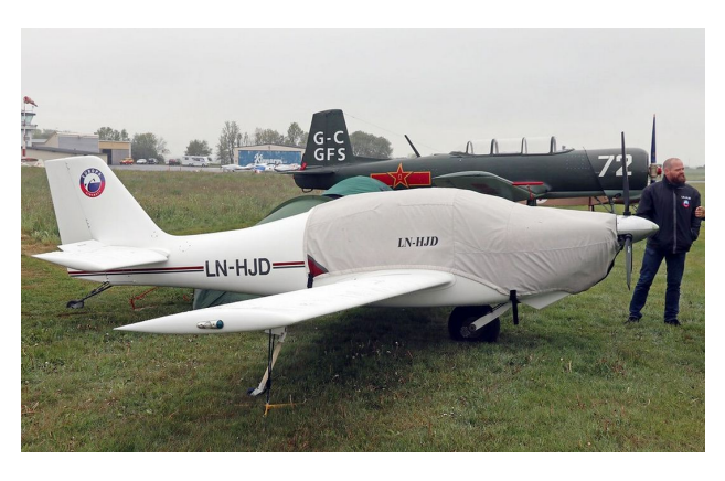
Europa Canopy/Engine Cover