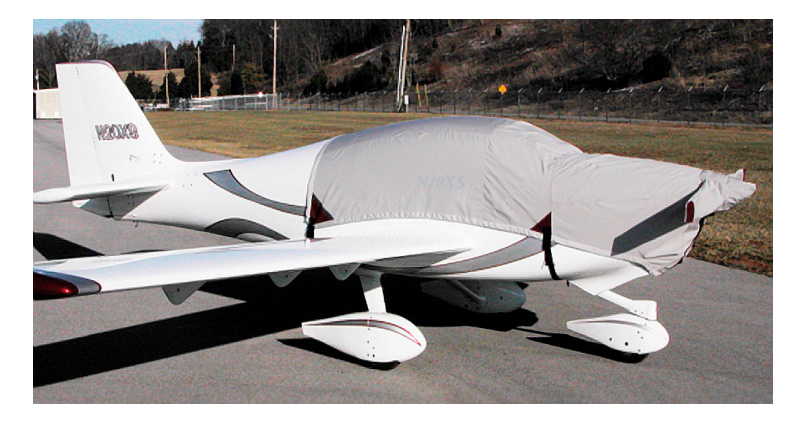
Canopy/Engine and Prop/Spinner Covers (tri-gear model)

This cover type is made from Silver Acrylic Sunbrella canvas and is 100% lined with a soft and smooth microfiber. Bruce's Custom Covers developed this material combination especially for aircraft protection. The outer material is medium weight and treated for water resistance, UV resistance and anti-static buildup. The inner lining is a very soft and smooth microfiber to prevent scratching. The material is very reflective, and tests show that the cabin interior temperature can be reduced to near-ambient temperature on the hottest of days. It is water, ice and snow repellent, yet breathable to allow moisture to escape from between the cover and the aircraft surface.