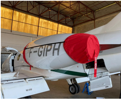
Falcon 10 Engine Covers, no TR's